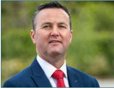
Sam Waide, CEO, Road Safety Authority

Ireland has made significant progress over the lifetime of previous road safety strategies. Since the launch of the first ever Road Safety Strategy in 1998, road deaths have declined by almost 70%. None of that progress could have been possible without our key stakeholders working together in a coordinated, strategic way.