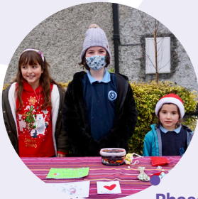
Phase 1 & 2 September 2021 - June 2022 Community Engagement for all ages

Love our Laneways is an initiative established by Dun-Laoghaire Rathdown County Council ('DLRCC') in partnership with A Playful City. The project is seeking to become an exemplar of how laneways can be reimagined by working with the local community. Pearse Drive/ 'The Gaps' in the Pearse estate has been identified by DLRCC as the first location for the Love Our Laneways pilot project.