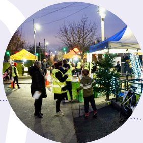
Phase 4 Oct 2023 Commencing Works on Site