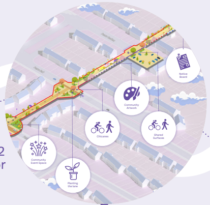
Phase 3 January 2023 APC Community Design Brief for DLRCC