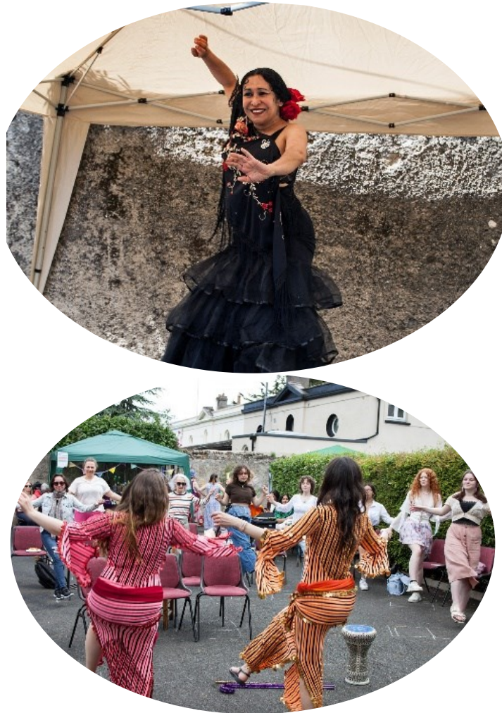
Figure 3 Photos of Women's Mini Festival in June 2021

The video of that event can be accessed here: https://youtu.be/iabkNHGBIEg