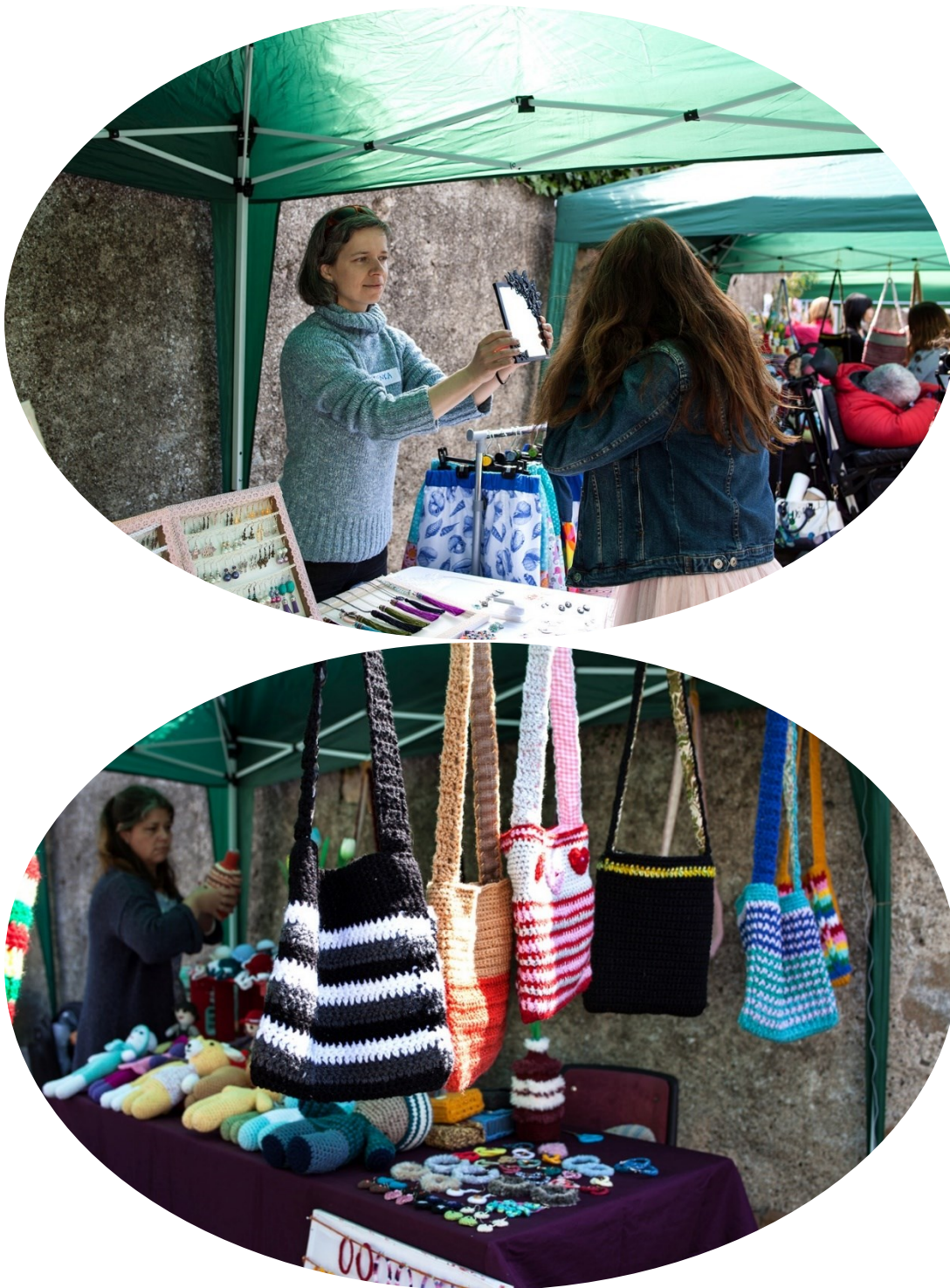
Figure 4 Some of the stalls at the Mini Festival June 2021