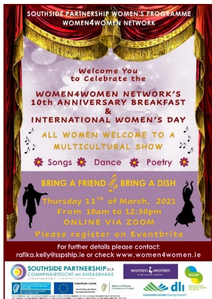
Figure 1 Flyer and photo of previous breakfasts