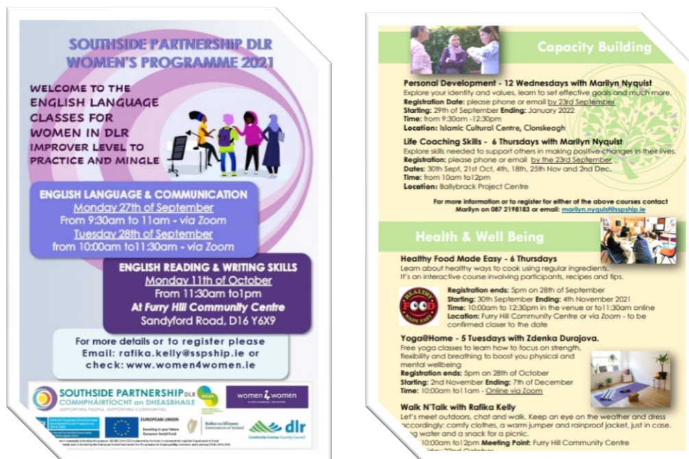
Figure 2 Sample flyers/brochure for upcoming courses