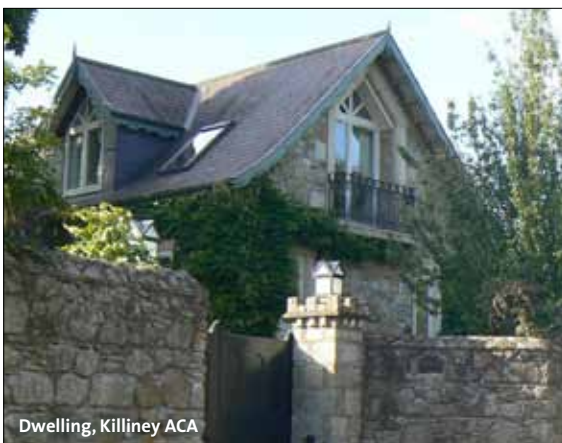
Dwelling, Killiney ACA

Well-designed and high quality shopfronts make a positive contribution to the appearance of an ACA. Conversely, insensitive and poorly crafted shopfronts detract from the character of the streetscene.