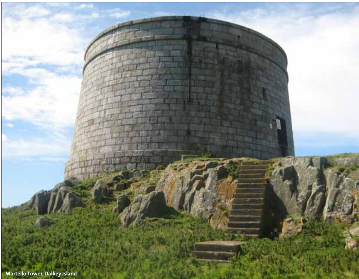
Martello Tower, Dalkey Island