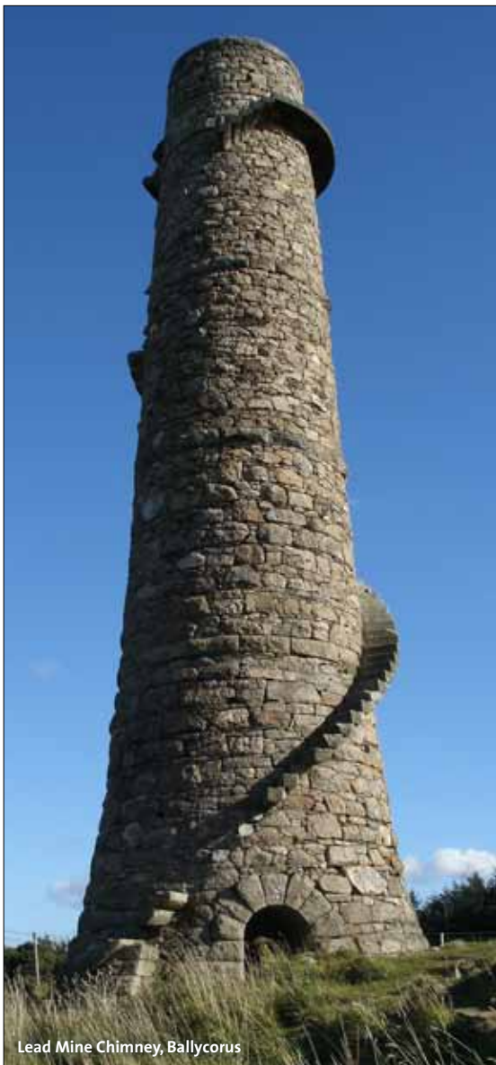
Lead Mine Chimney, Ballycorus

In recognition of the wealth of industrial heritage contained within the County, an Industrial Heritage Survey was carried under the 'County Heritage Plan' (2009).