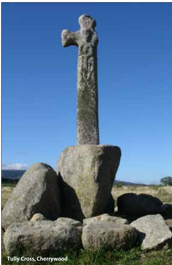
Tully Cross, Cherrywood

Protection of the historic environment is not about preventing change - rather it is about providing the appropriate tools and mechanisms through the County Development Plan to manage change in a positive way, so that it enhances rather than diminishes the historic environment.