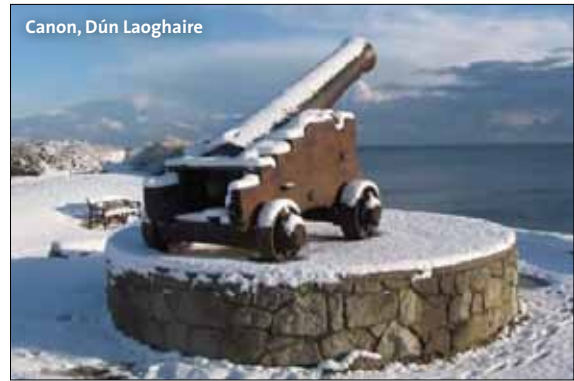
Canon, Dún Laoghaire