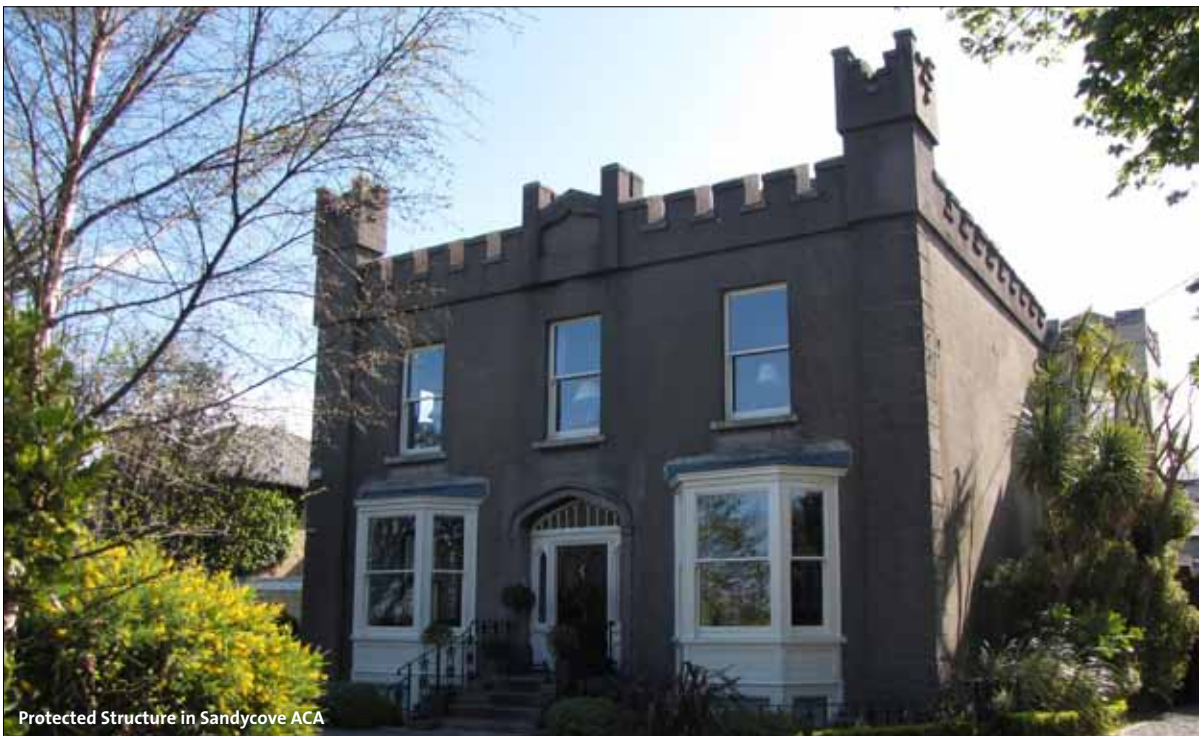
Protected Structure in Sandycove ACA

The Council has responsibility for a wide variety of structures of heritage significance, many of which are included on the RPS and/or RMP, including Marlay House, Cabinteely House, Martello Towers and Carnegie Libraries, the Dún Laoghaire Baths Pavilion and some examples of good quality early twentieth century housing.