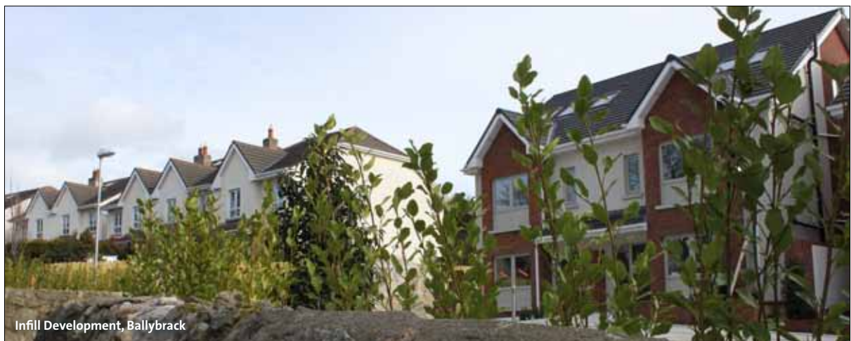
Infill Development, Ballybrack