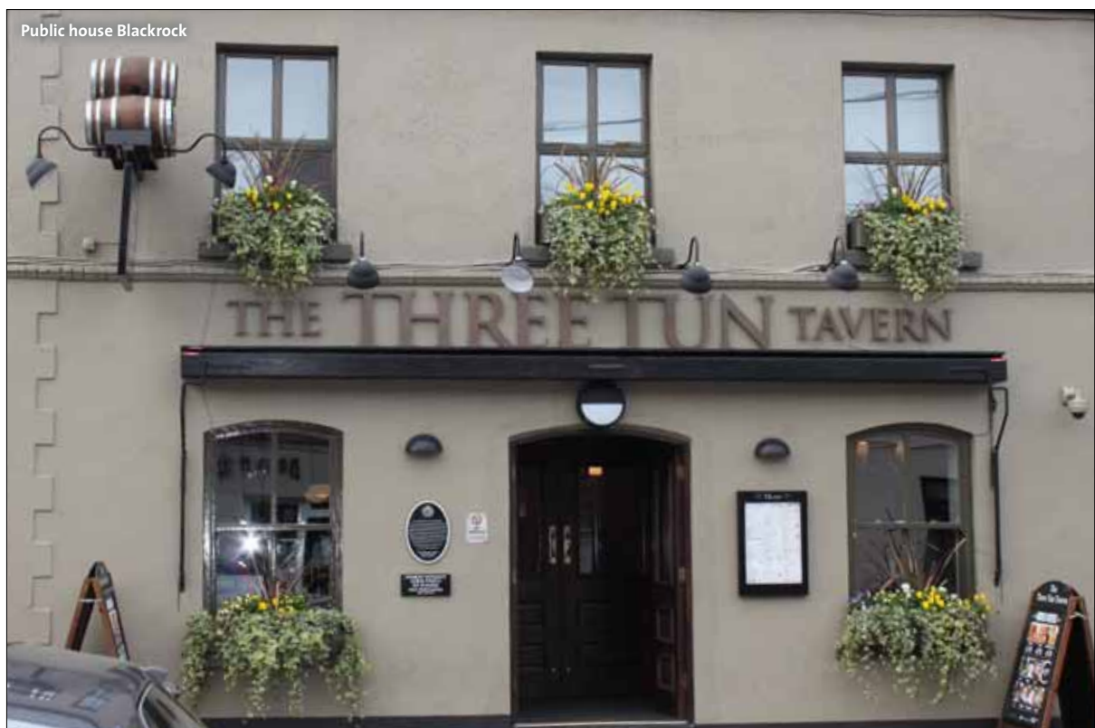
Public house Blackrock

Advertising signs, where permitted, should be simple in design and sympathetic to the surroundings