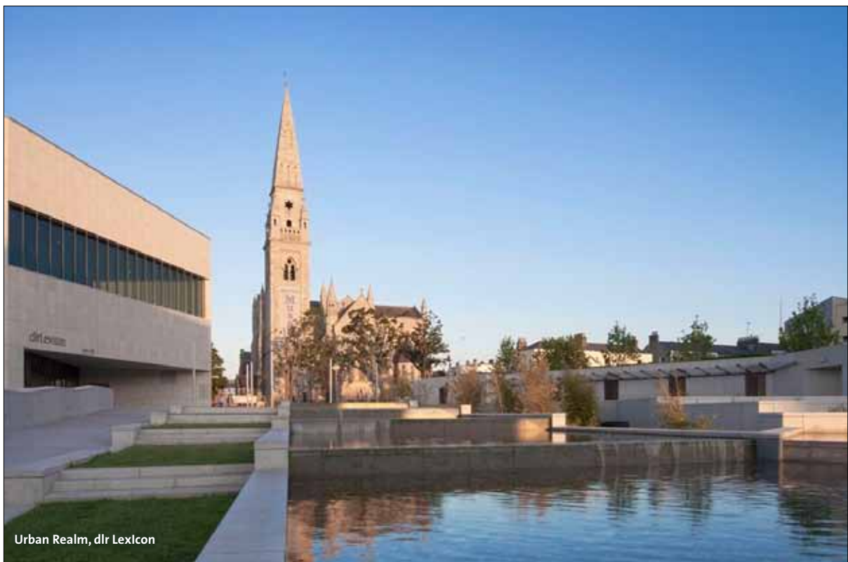
Urban Realm, dlr Lexicon

Into the future, further LAPs will be prepared as deemed necessary by the Elected Member having regard to the specific criteria outlined in section 2.1 of 'Local Area Plans - Guidelines for Planning Authorities' (2013). These will set quite detailed and specific design parameters and urban design contexts, as appropriate, for the specific areas in question.