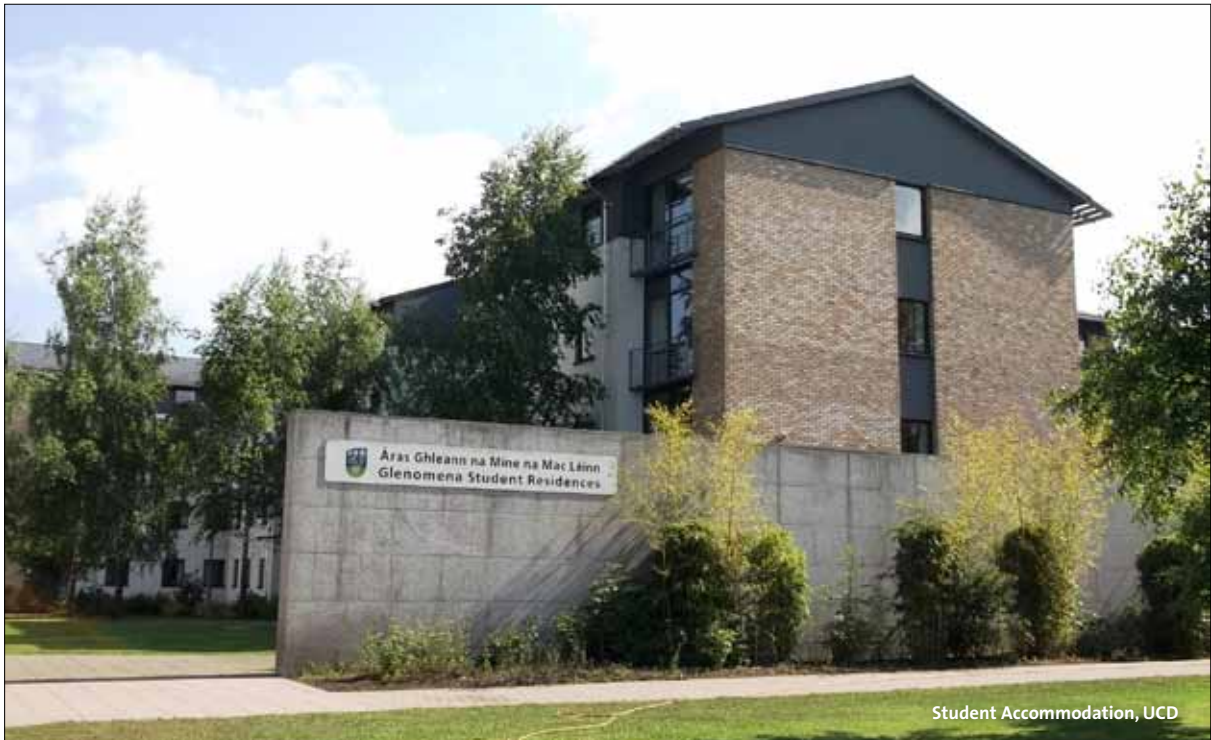
Student Accommodation, UCD

In addition to the provision of adequate open space, on Institutional Lands where existing school uses will be retained, any proposed residential development shall have regard to the future needs of the school and allow sufficient space to be retained adjacent to the school for possible future school expansion/redevelopment.