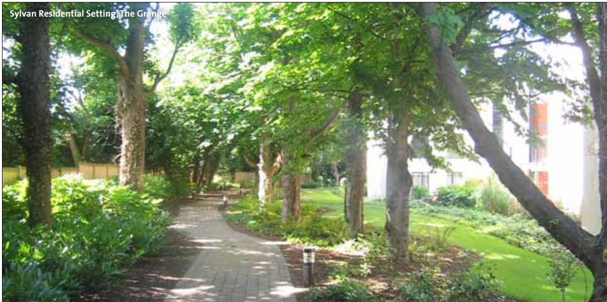
Sylvan Residential Setting, The Grange