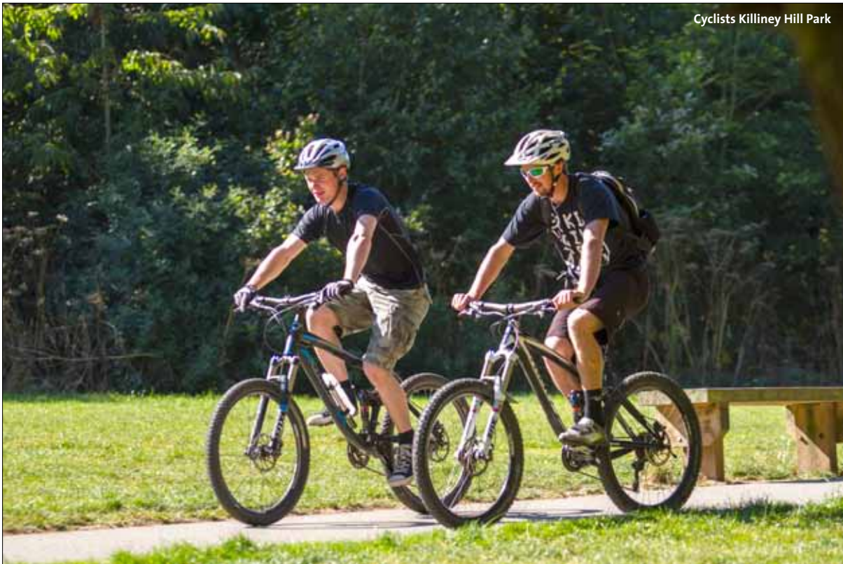
Cyclists Killiney Hill Park

whereby double parking bays are placed length to length is discouraged.