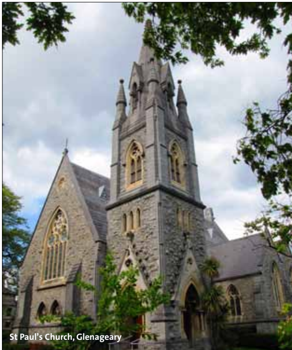
St Paul's Church, Glenageary