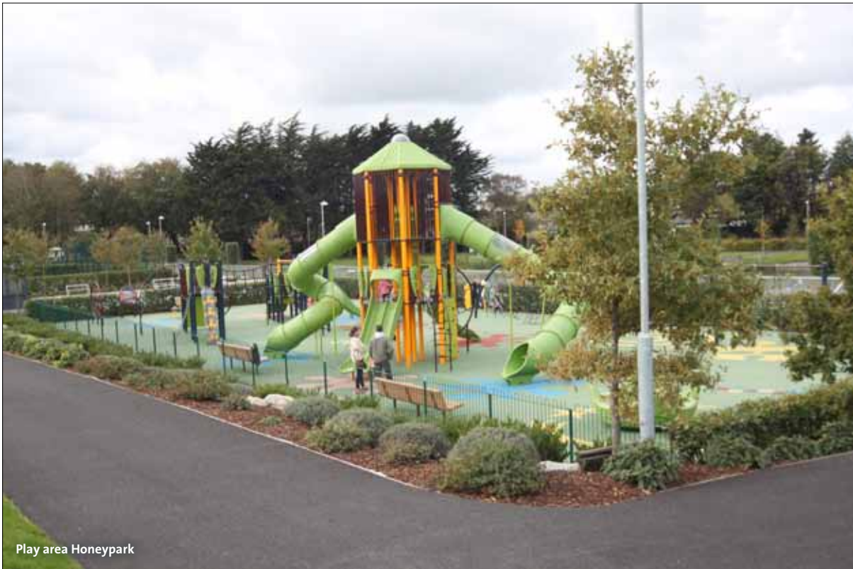
Play area Honeypark