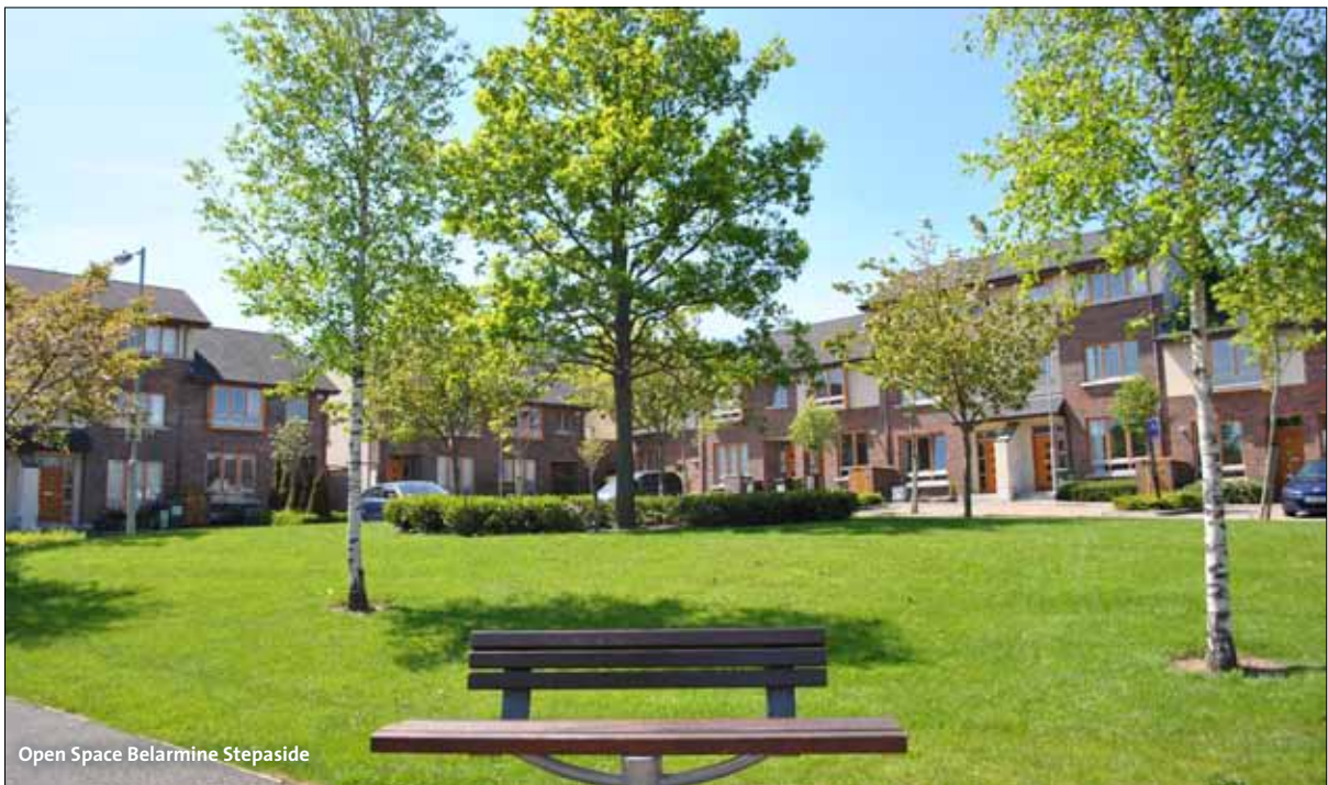
Open Space Belarmine Stepside