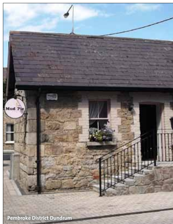
Pembroke District Dundrum