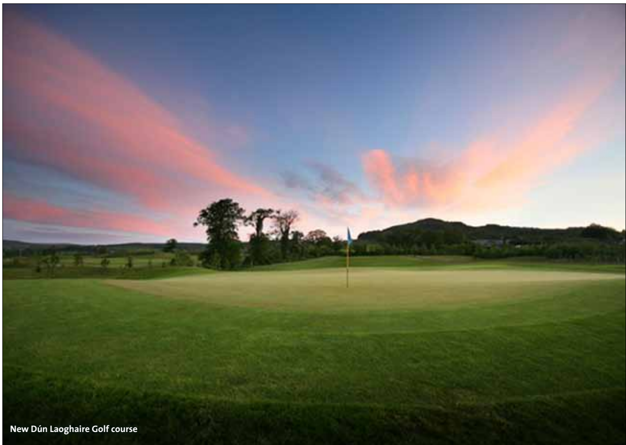
New Dún Laoghaire Golf course