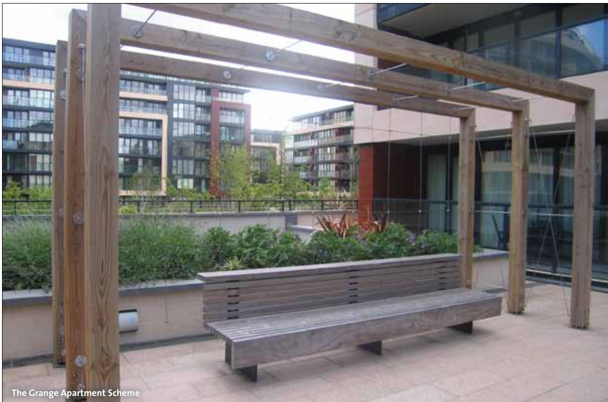
The Grange Apartment Scheme

The guidelines 'Sustainable Residential Development in Urban Areas' (2009) sets out key planning principles to be reflected in Development Plans and Local Area Plans, which should assist in the preparation and assessment of planning applications for residential