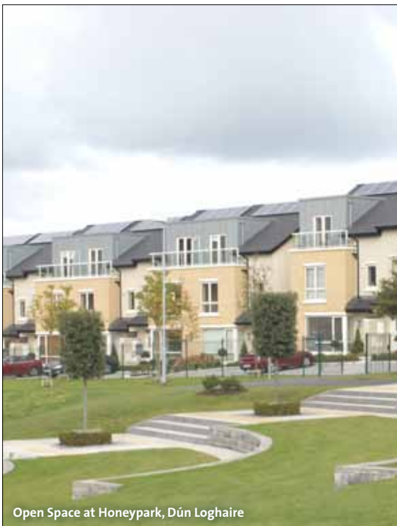
Open Space at Honeypark, Dún Loighaire

In all development proposals, particularly residential development, it is the aim of the Planning Authority to promote a high level of amenity and design, and to protect and complement existing amenities and