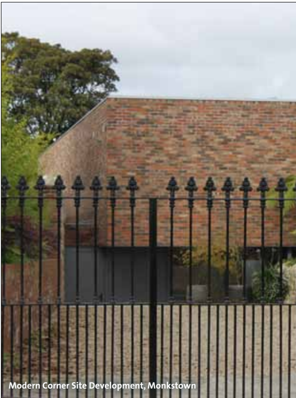
Modern Corner Site Development, Monkstown

the design nor the use of the proposed structure will detract from the residential amenity of adjoining property or the main house.