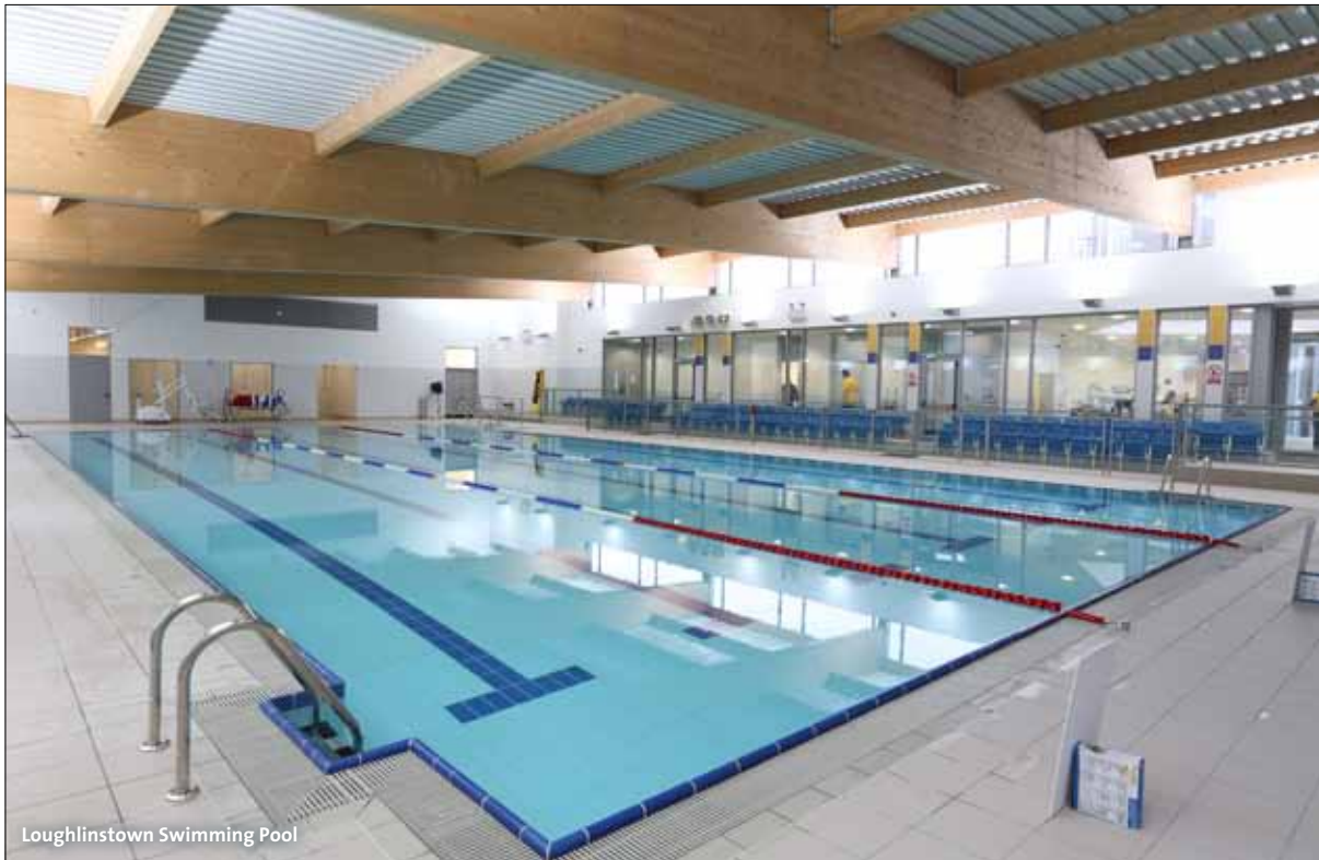
Loughlinstown Swimming Pool

In assessing applications for new childcare facilities, the Planning Authority will consult with the Dún Laoghaire-Rathdown County Childcare Committee to assess the need for the type of facility proposed at the intended location.