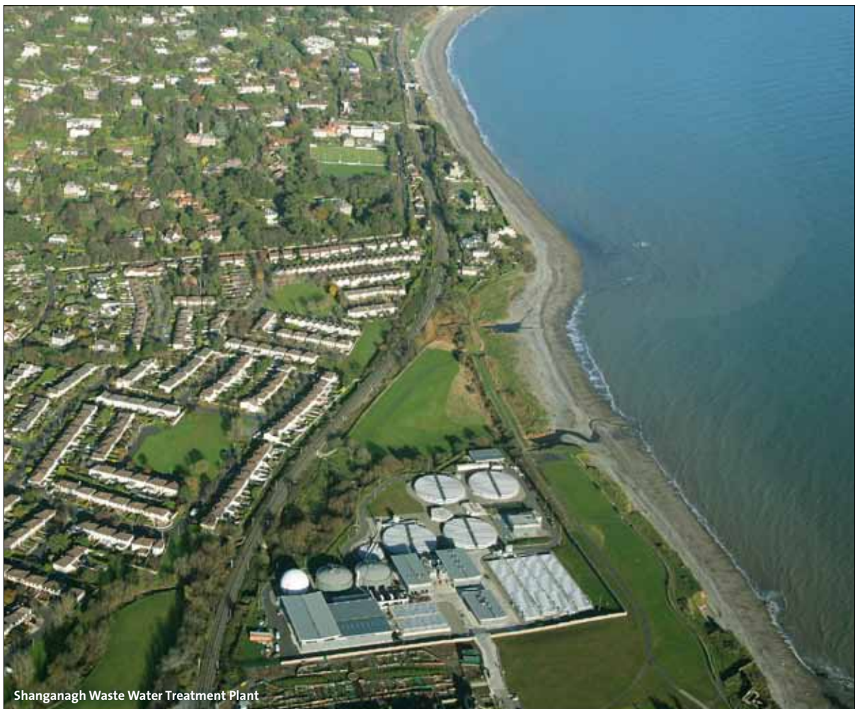
Shanganagh Waste Water Treatment Plant