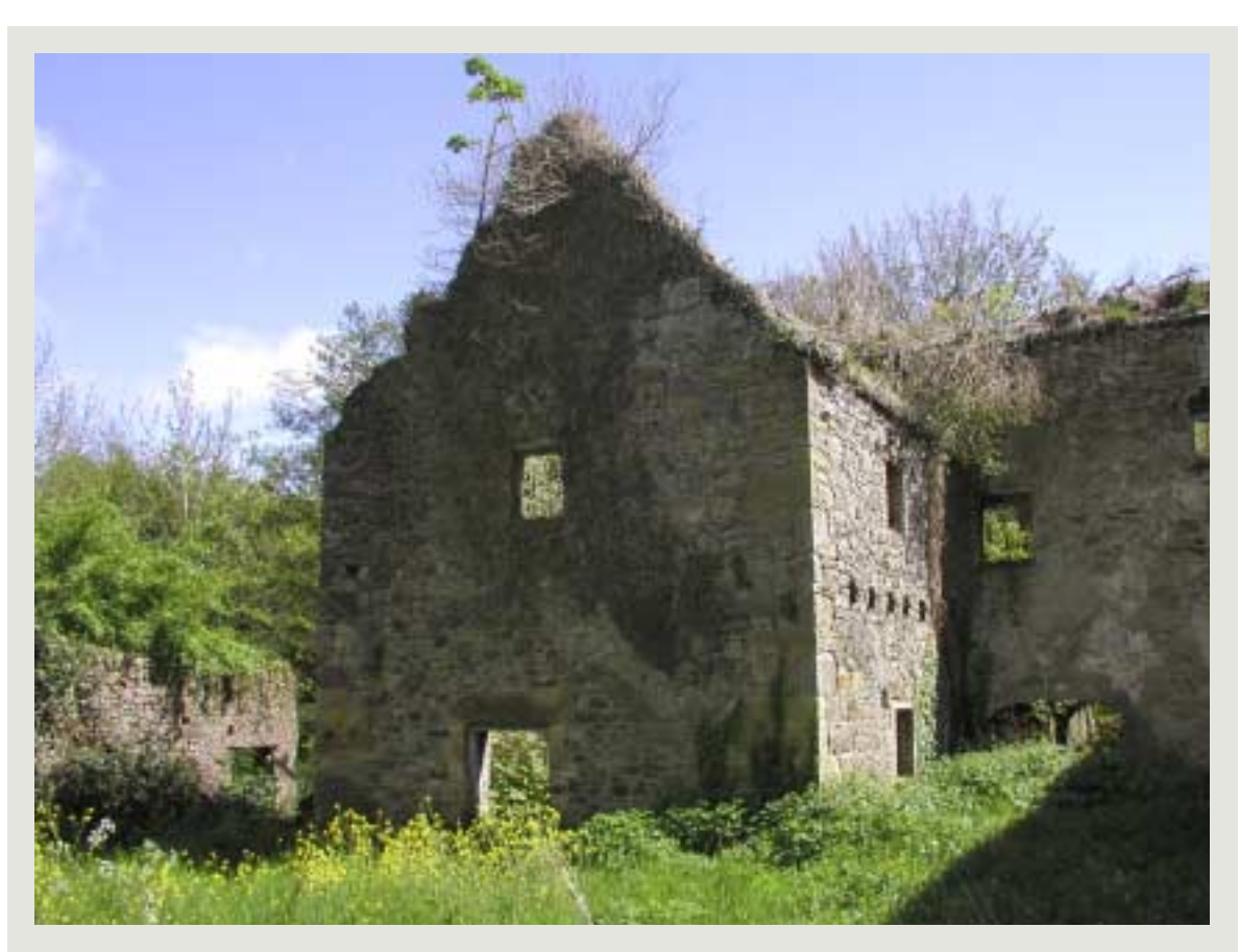
Many structures make impressive ruins. In some cases restoration may be the preferred option where the ruin's character can be retained. Other ruinous structures may be more appropriate for consolidation as ruins where restoration would require loss of historic fabric and largely conjectural reconstruction. Care should be taken when considering the most appropriate approach concerning ruins which stand as landmarks of the past – religious, industrial, social or political icons

Non-habitable protected structures may pose different conservation problems to other structures because of the nature of their construction or use. Some frequently encountered types are dealt with in this section. Where proposed works under consideration concern the repair of structures, the appropriate methods are described elsewhere in these guidance notes.