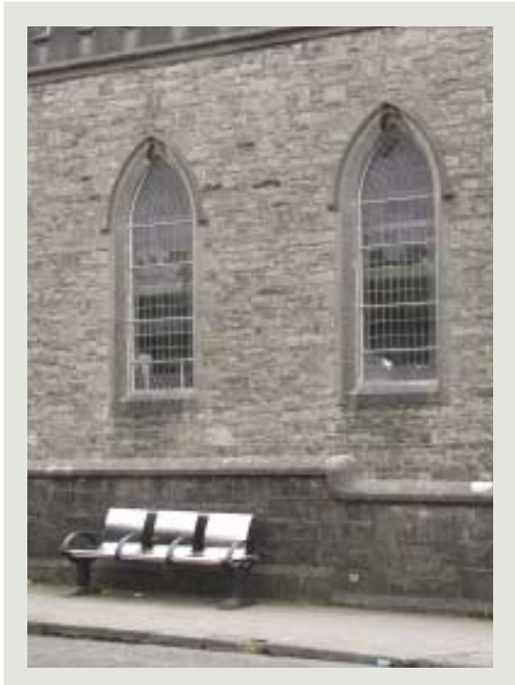
New street furnishings do not have to be 'traditional' in style or material to be considered appropriate. The use of modern designs and materials may provide a satisfying visual counterpoint to the historic setting