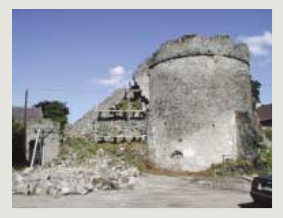
Ivy has been removed from this mediaeval mural tower after an detailed record was made of the fabric to ensure that potential loss or damage to the stonework could accurately be remedied, reusing the historic fabric without resort to conjecture