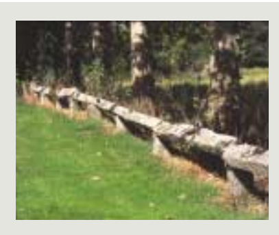
Many items of street furniture were fabricated locally in long-vanished small factories or workshops using locally-available materials, which gives them a social and historical interest in addition to creating regional design differences, as is evident in this Carlow granite