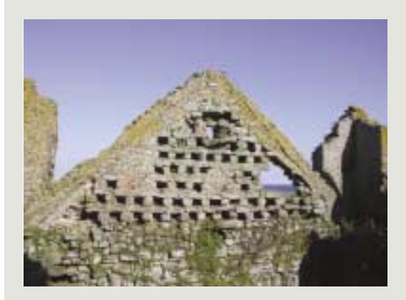
Some ruins may require careful dismantling and re-erection of parts of walls that have become unstable. In this case, apart from the repair work required to the gable (containing pigeon nesting boxes), it is intended to re-roof the building. Where it is appropriate to re-roof a ruinous structure, the aim should be to retain the maximum amount of original fabric