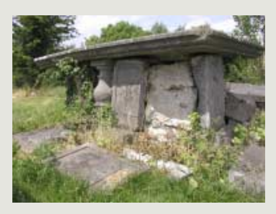
While there is generally a respect in communities for burial grounds, the wish to maintain them should not lead to overenthusiastic or misguided 'tidying-up' works or the uninformed reconstruction of damaged memorials. Where repairs are planned to damaged memorials, all fragments should be identified and reset using an appropriate mortar, and any poorly executed previous repairs rectified, if this can be achieved without further damage. Specialist advice will usually be required

14.6.4 Gravestones and memorials in old burial grounds are of immense historical, social and artistic interest and can be important sources of information to local historians and others. They should be treated with great respect, carefully maintained and reerected where they have fallen. They should not be moved unnecessarily in order to facilitate activities such as grass cutting. The use of broken or dislocated headstones as paving should not be permitted. Where dislocated headstones or flat stones have been used historically as paving and where inscriptions or carvings survive, consideration should be given to preserving these either by removing them to a safe location or by re-routing paths to avoid future erosion by foot-traffic.