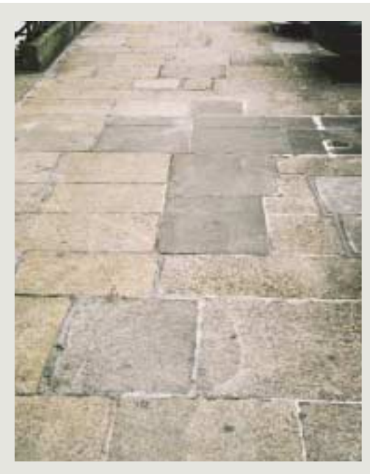
Damage caused to historic paving stones by repeated lifting can lead to breakage of individual stones. The replacement of areas of lost stone with concrete should be avoided as it significantly degrades the appearance of a historic pavement