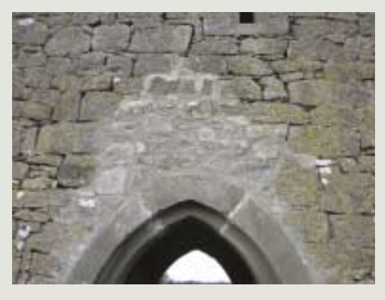
Care should be taken to match repairs to the existing in terms of materials and workmanship. This mediaeval doorway was rebuilt using an inappropriate cement mortar. The stones above the point of the arch have been set in a random pattern and finished with wide joints quite unlike the surrounding stonework