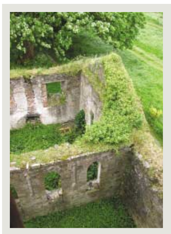
Exposed wall heads are generally the most vulnerable parts of a ruined structure. The method proposed to cap exposed wall heads should not result in water being trapped inside the core of the wall and should be visually acceptable. In some cases, the ruinous structure may need to be monitored over a period of time before a decision can be made as to what work might be appropriate

Where permission is granted, it should include conditions to repair and retain as much of the historic fabric as possible. The methods of rebuilding, and the materials used should not cause damage to surviving earlier work that contributes to the character of the protected structure. The applicant should be required to use expert advice in identifying original or early fabric. There may be traces of paint, plaster or render coatings to internal or external walls, which should be recorded and/or preserved.