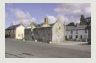
In this instance, a ruined markethouse marks the centre of a planned village. Despite its ruined state it forms a local landmark which, if lost, would remove the focus of the historic townscape