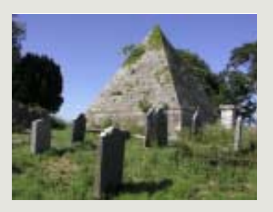
Many graveyards include important funerary monuments, such as this impressive eighteenth-century pyramidal mausoleum. They may also include gravestones with finely carved inscriptions, all of which have architectural as well as social and historical significance