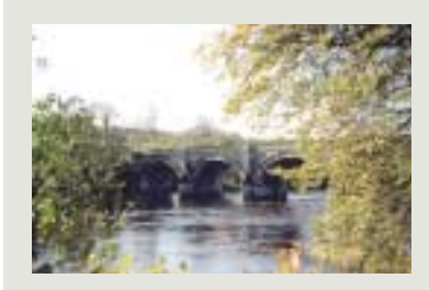
Bridges are primarily functional structures, however many of them are also aesthetically pleasing. On a finely detailed masonry-arched bridge, features of special interest may include abutments, parapets, cut-waters, string courses and paving