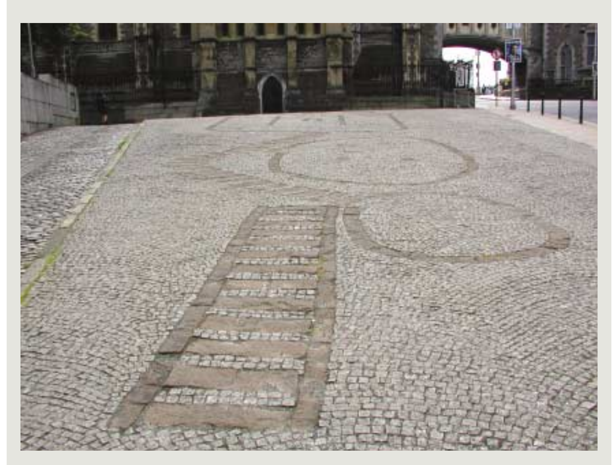
Where new paving is required, the opportunity may arise to have a pavement designed especially to suit the character of the area. This paving outlines the site of excavated Viking housing and is interspersed with inset bronze plaques depicting finds made during archaeological excavations in the area