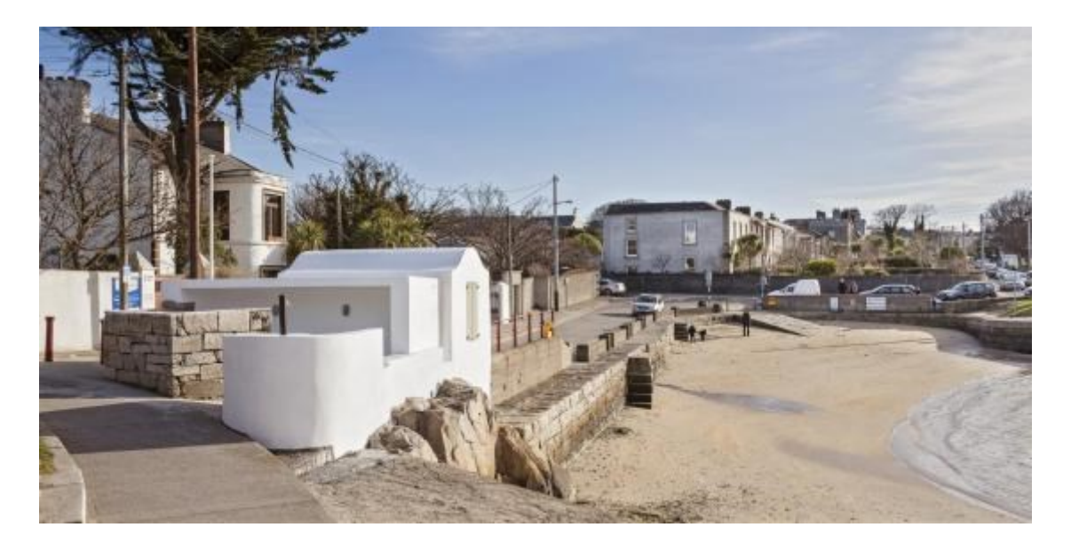
Fig. 1: Sandycove Beach

Water Quality monitoring at Sandycove Beach is already carried out and reported on. In addition, a lifeguard service is provided during the bathing season.