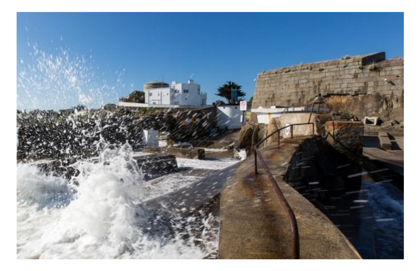
Fig. 3: Forty Foot Bathing Area

Water quality monitoring is not currently carried out at the Forty Foot. It is intended to commence water quality monitoring at this location with a view to establishing a bathing water profile in accordance with the Bathing Water Regulations 2008. For safety reasons, it is not intended to provide a lifeguard service at this swimming location.