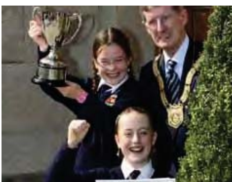
Children from St. Patrick's NS, Glencullen, winners of dlr Tidy Schools in the Community Competition – September 2011.