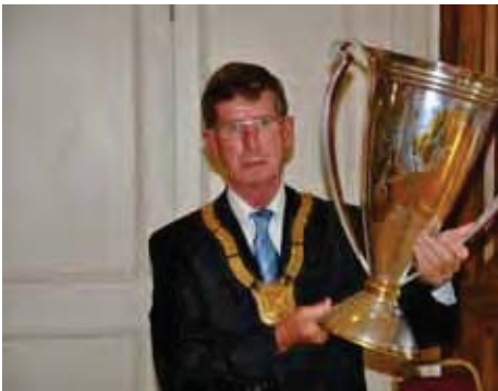
The Heineken Cup visiting County Hall during the Autumn following Leinster's 2011 win