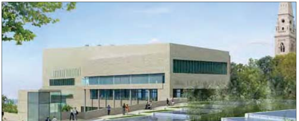
Architects rendering of the completed Central Library and Cultural Centre