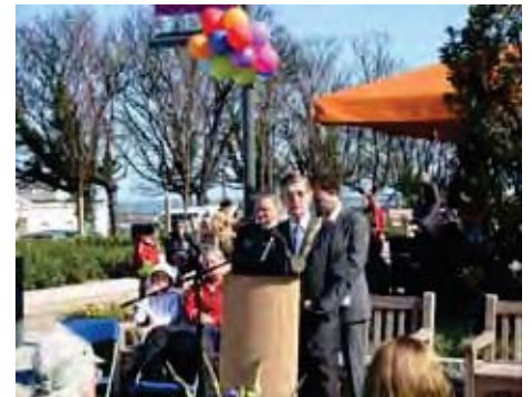
Opening of The Metals – April 2012