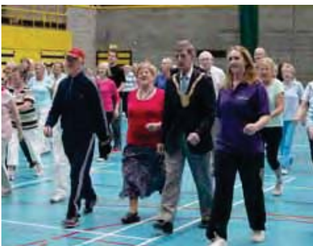
"Stepping Out" at Sportsfest – August 2011