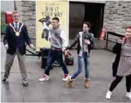
Launch of Bin Your Gum Campaign – May 2012