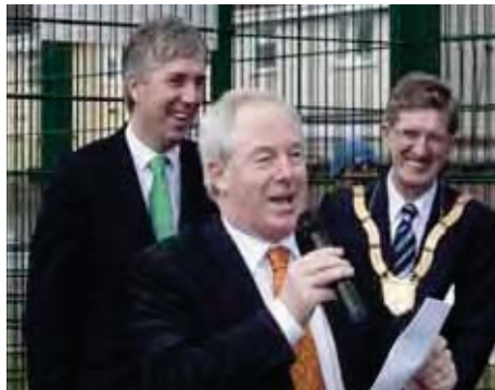
Opening of All-Weather Pitch in Hyde Park, Dalkey with Mr. John Delaney, Chief Executive of FAI & Mr. Michael Ring, Minister of State for Tourism & Sport – November 2011