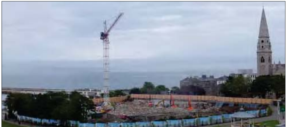
Central Library and Cultural Centre – construction underway June 2012

The Part 8 planning scheme for this project was approved by the Council in November 2009, following which John Sisk and Sons were awarded the tender for the building works. The building is due for completion in 2014.