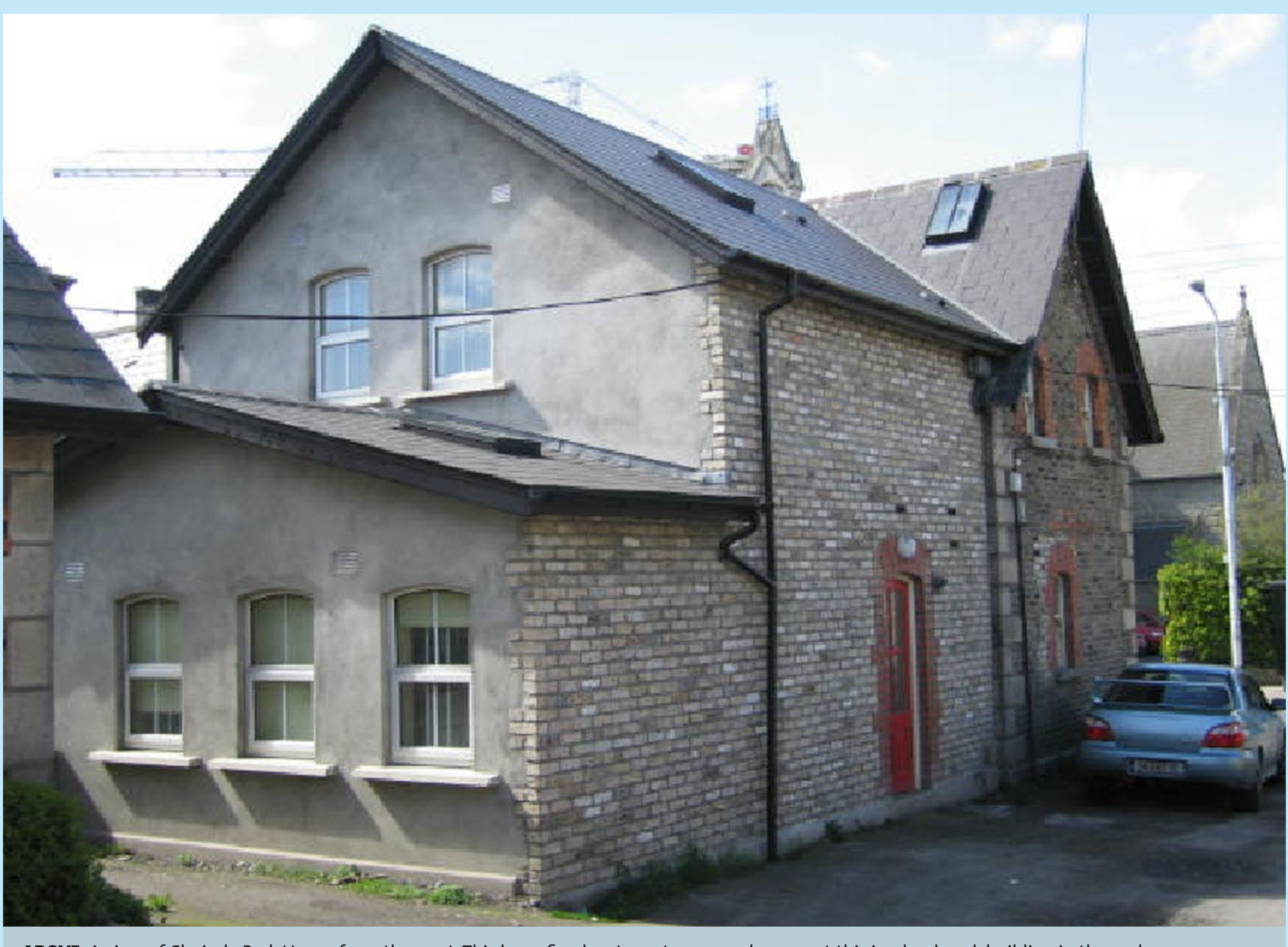
ABOVE: A view of Clarinda Park House from the west. This large five-bay two-storey over basement this is a landmark building in the park.

Any extension will require planning permission and every effort should be made to consult with the Conservation Division when planning an extension.