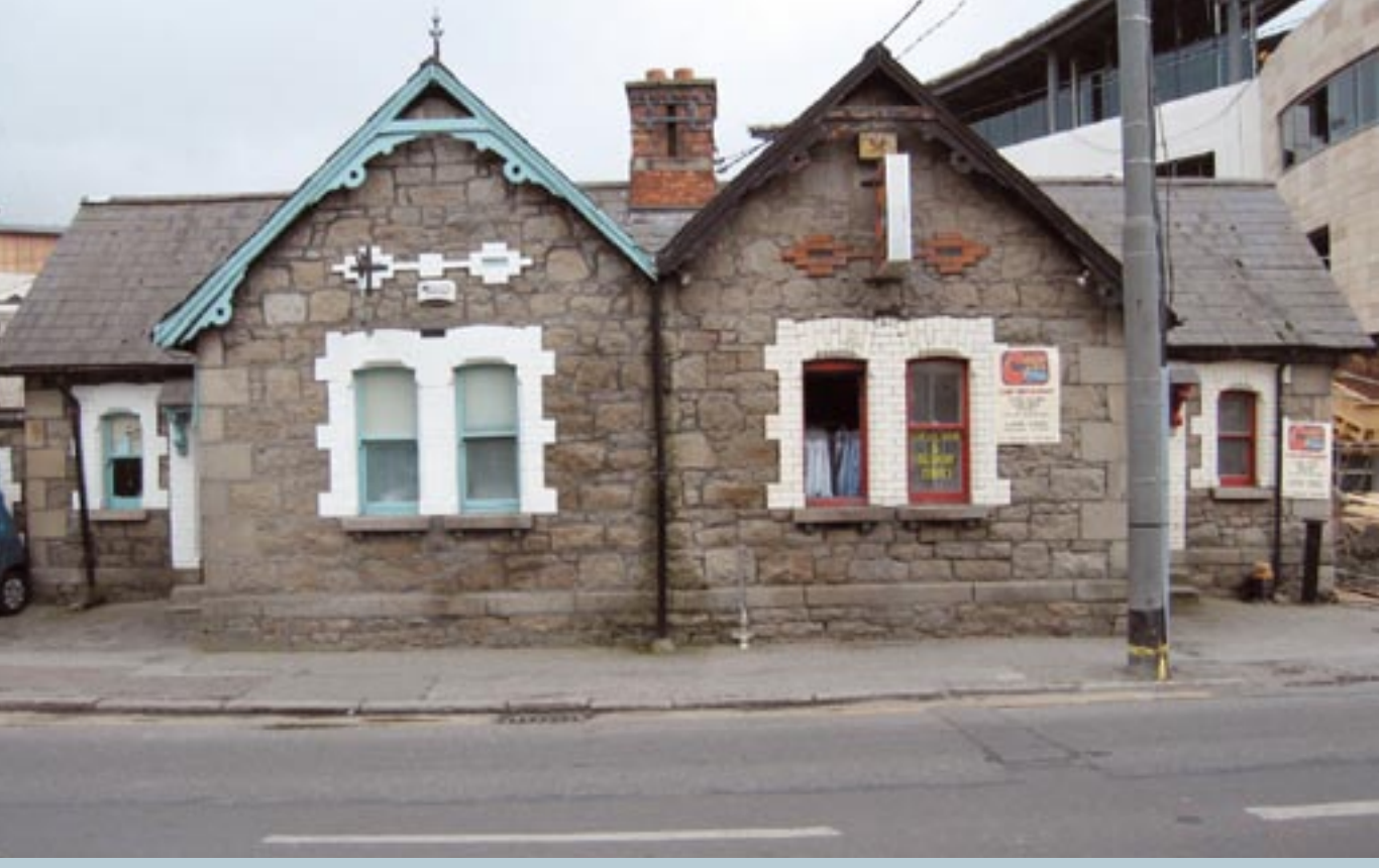
ABOVE: Pembroke Cottages, Ballinteer Road

The Pembroke Cottages, Booterstown, form a distinct grouping of cottage dwellings on Booterstown Avenue, which are unlike any other group to be found on the road. The group is distinguished by two pairs of semi-detached dormer two-storey brown brick houses, which flank the entrance to the lane giving access to a group of fourteen single-storey cottages. The cottages are arranged around two sides of a private road, which runs westwards off Booterstown Avenue, before returning to the south and terminating at a T-junction with Rosemount Terrace. The single-storey cottages are arranged in pairs of semi-detached houses, each pair is joined by rubble granite or brown brick screen wall, with paired door openings which gives direct rear site access.