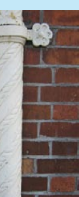
ABOVE: Spiral fluted cast-