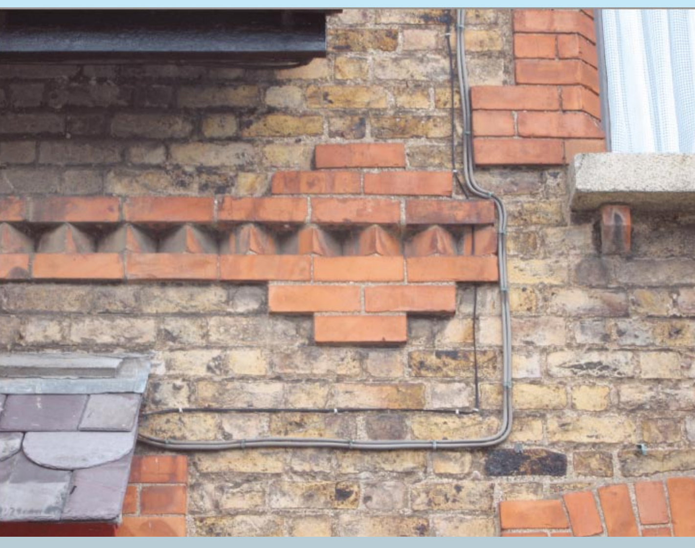
ABOVE: A view of Clarinda Park House from the west. This large five-bay two-storey over basement this is a landmark building in the park.

Wrought-iron in the form of a mounted finial emphasises the top of each gable.