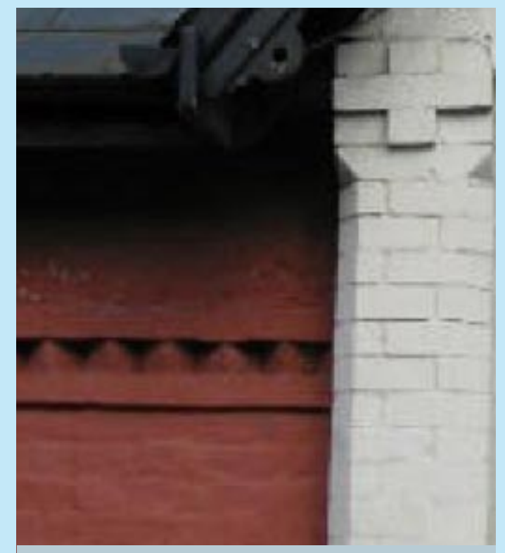
ABOVE: Painting of polychrome brick facade.