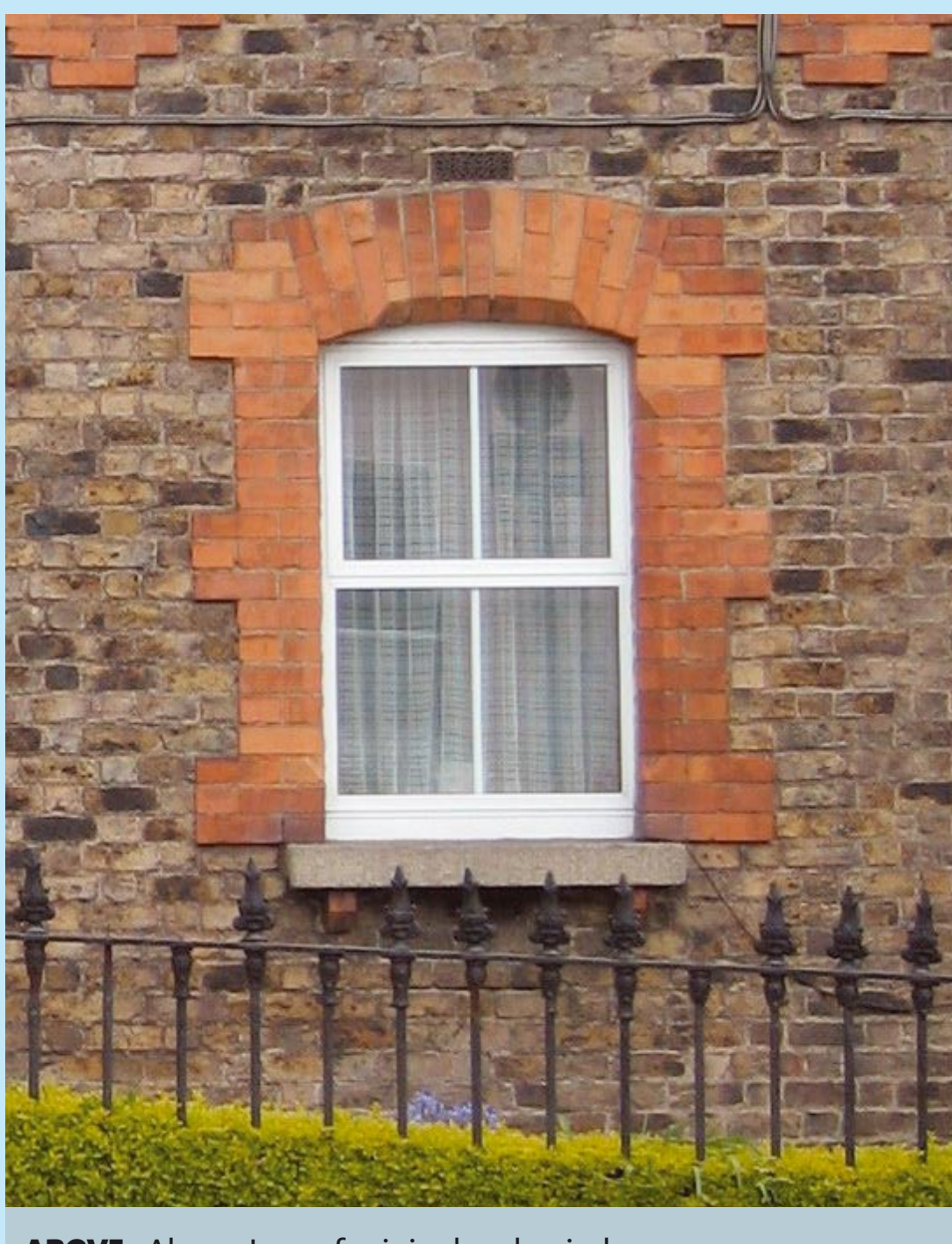
ABOVE: Above: Loss of original sash window

The pandemic use of uPVC windows as a preferred alternative to original timber sash windows has not escaped the