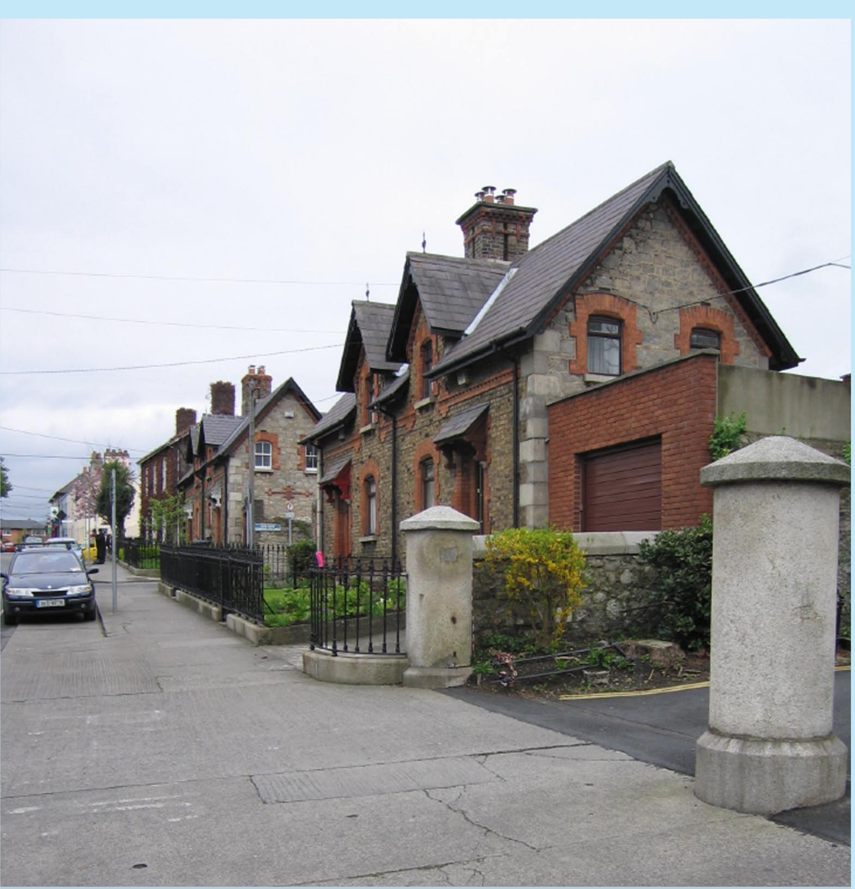
ABOVE: View of the Pembroke Cottages, Booterstown Avenue

The existing boundaries of Nos. 1-6 Pembroke Cottages, Ballinteer Road are satisfactory.