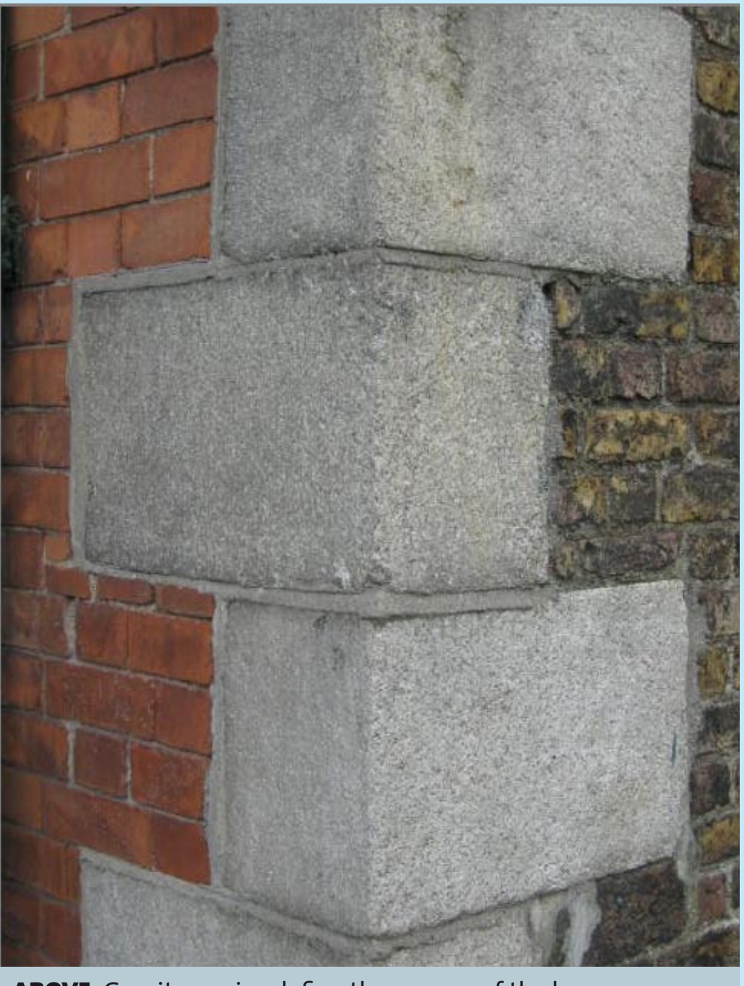
ABOVE: Granite quoins define the corners of the houses.

The Pembroke Cottages on Booterstown Avenue can be subdivided into two distinct groups. The first are the semidetached two-bay dormer two-storey houses facing east onto Booterstown Avenue and the second are the three-bay singlestorey cottages on either side of the lane accessed from both Booterstown Avenue and Rosemount Terrace.