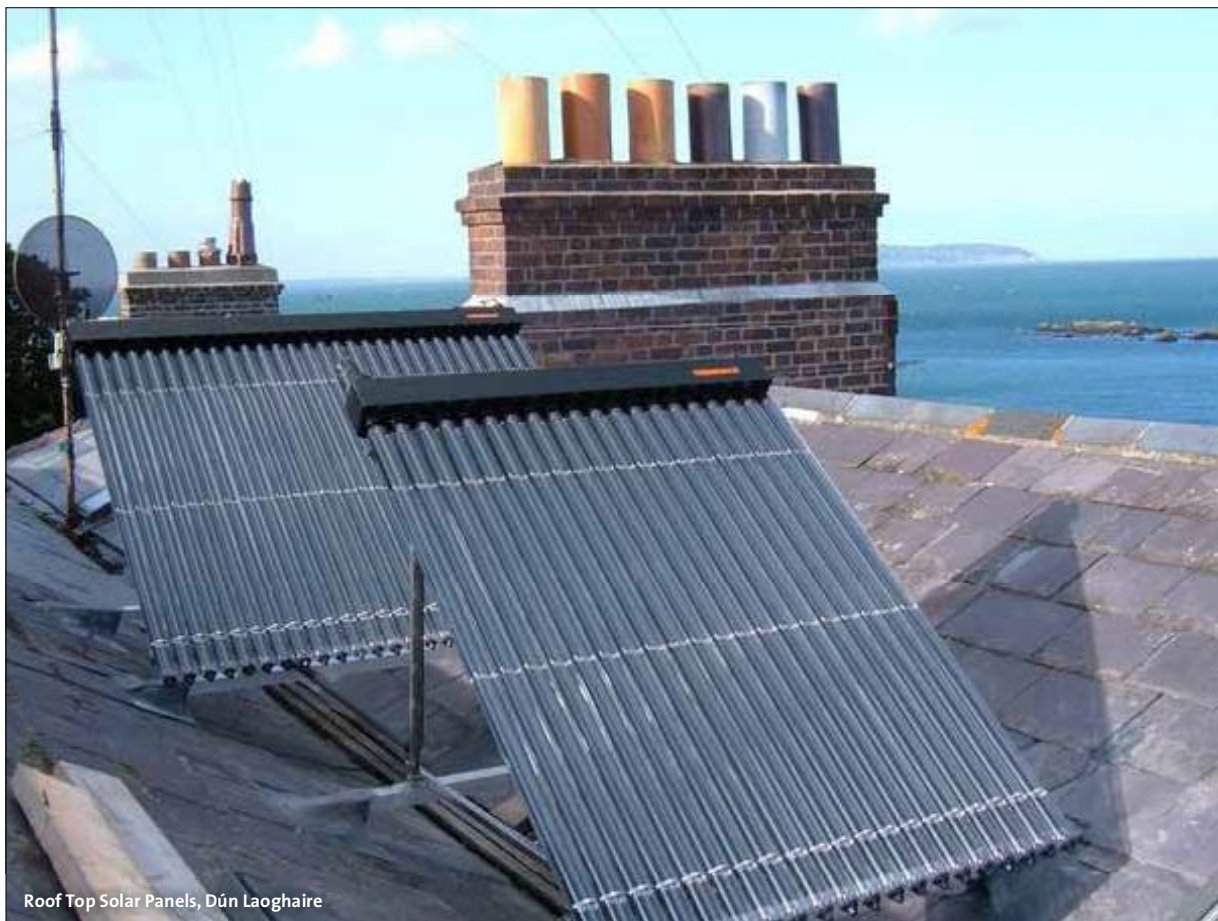
Roof Top Solar Panels, Dún Laoghaire

Technical Guidance Document C of the current Building Regulations provides technical information on the importance of radon prevention measures within dwellings and how they should be installed effectively. In an era of increasing sustainability of