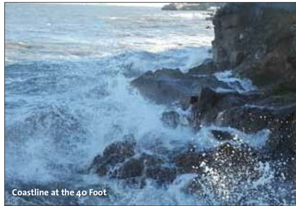
Coastline at the 40 Foot

a planning application (Refer to Section 6 of Appendix 13).