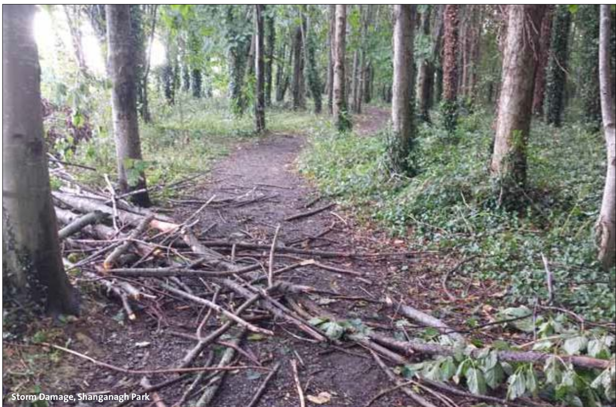
Storm Damage, Shanganagh Park

It is envisaged that the preparation of a Dún Laoghaire-Rathdown Adaptation Strategy will, in due course, be carried out by an interdisciplinary team, in liaison with