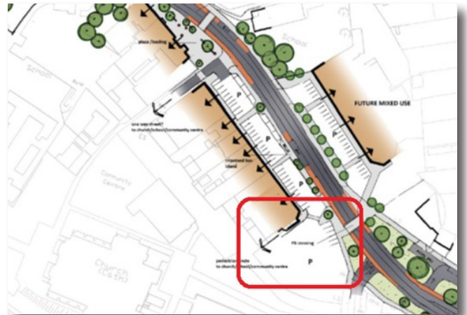
Figure 10: MillHouse Long Term Proposal