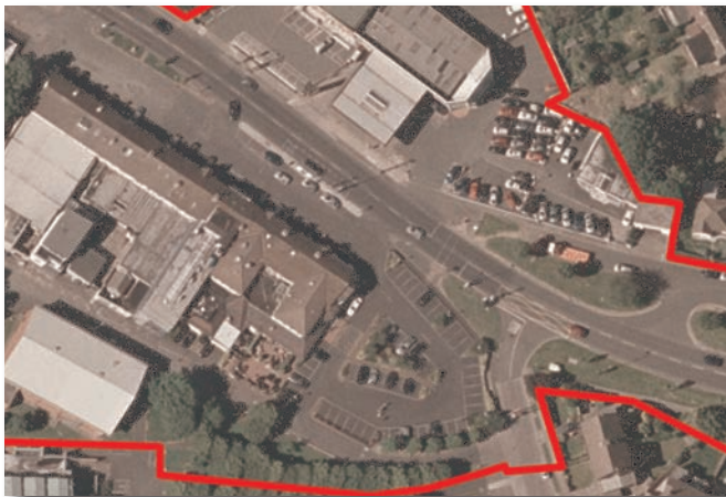
Map 22: MillHouse Site

Generally, previous development proposals on the site were refused planning permission on grounds of over development. The Site Development Framework below sets out development parameters more appropriate to the 'Neighbourhood Centre' zoning of the site.