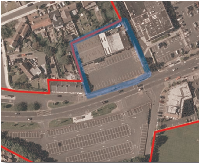
Map 23: Stillorgan Mall