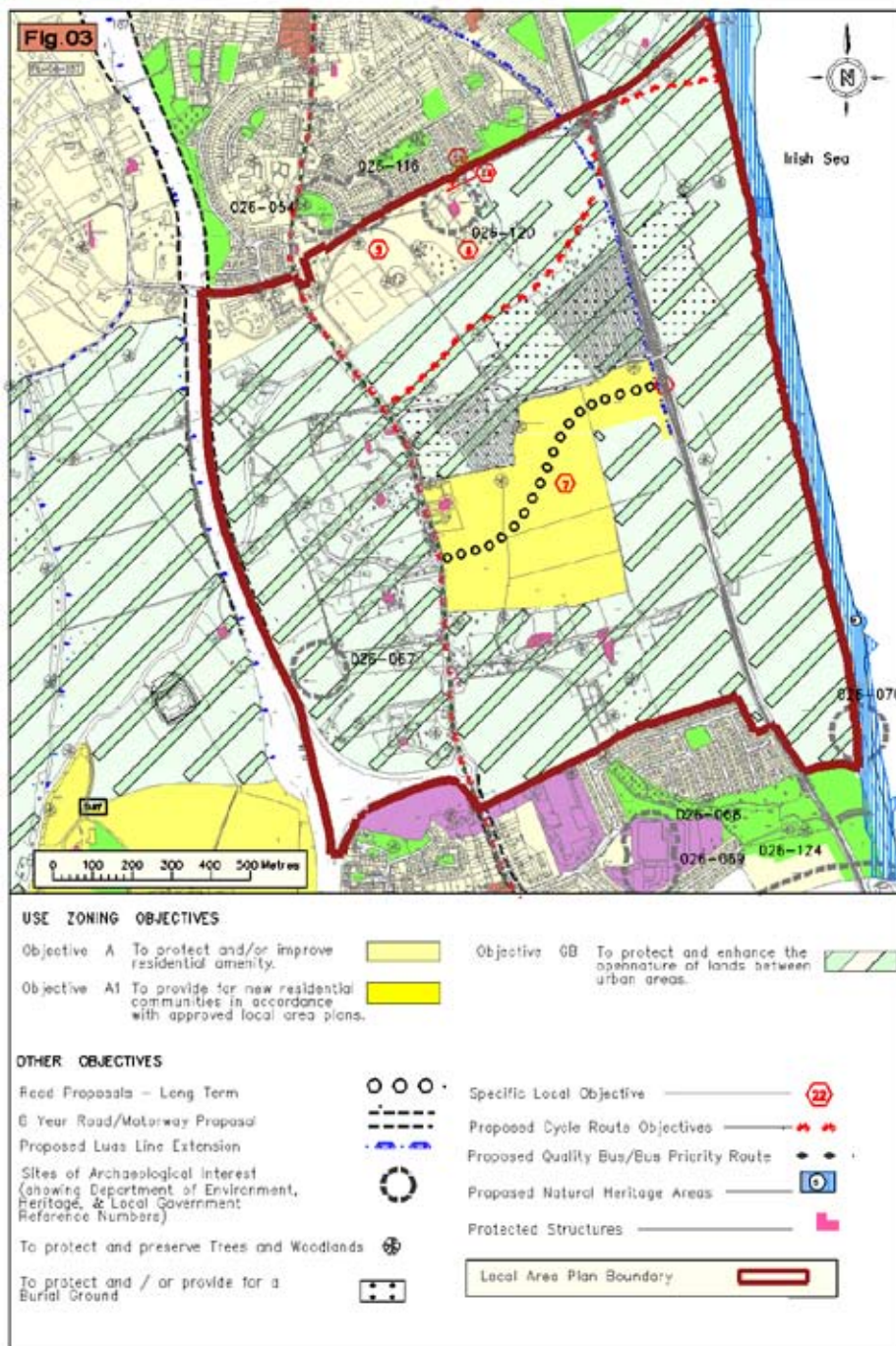
Figure 3: Extract from County Development Plan

Dun Laoghaire Rathdown 2004 – 2010 County Development Plan contains the following Specific Local Objectives pertaining to the Plan area (see Figure 3):