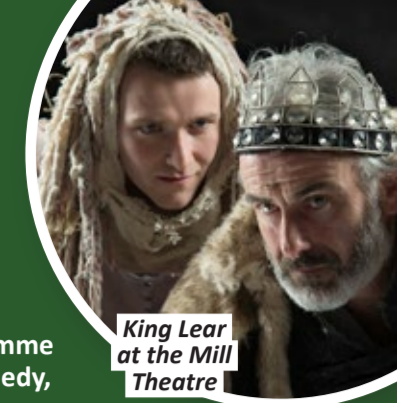
King Lear at the Mill Theatre

PAVILION THEATRE With an eclectic programme of theatre, cinema, comedy, literature, opera, dance, workshops, festivals and local arts, the Pavilion Theatre provides the cultural heartbeat for Dún Laoghaire town. +353 (0) 1 231 2929, www.paviliontheatre.ie