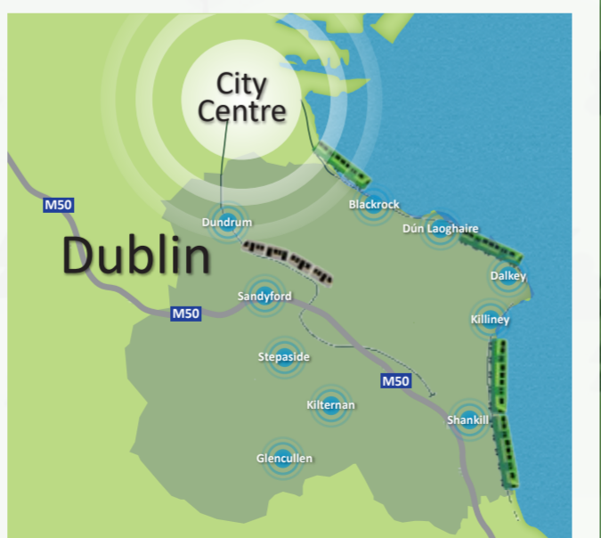
Just 20 minutes from Dublin City Centre

You'll discover some of Ireland's richest literary and cultural heritage when you go Between The Lines in Dublin. It is a landscape of story-makers, story-tellers and story-keepers which has inspired multiple Nobel Laureates and many other iconic and contemporary writers. A packed calendar of events and festivals stands testament to the health of this living, breathing literary tradition. Visit one while you're here — you never know which famous author, artist, actor or pop star you might catch a glimpse of! It is just part of an incredible cultural experience encompassing archaeological, architectural, artistic, ecclesiastical, musical and maritime attractions. Step into the past at Dalkey Castle, step into the future at the Explorium science and sports centre, dance a jig at a gig in the mountains, enjoy some shopping and a show, or simply savour the Victorian grandeur of Monkstown and Dún Laoghaire. There are a host of free heritage tours and exhibitions to explain what connects the people and places in this unique part of Dublin. They are designed to help visitors uncover chapter and verse about the less well known aspects of our story as you go Between The Lines.