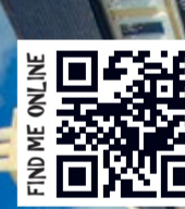
FIND ME ONLINE