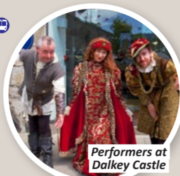
Performers at Dalkey Castle

This interactive children's museum is a hands-on, minds-on fun and learning centre which encourages all visitors to get involved. +353 (0)1 217 6130, www.imaginosity.ie