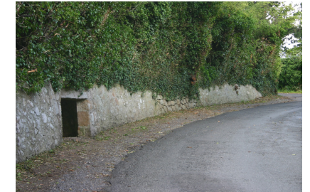
Above: Possible well, Lehaunstown Lane

There are two surviving notable entries from the Industrial Heritage Survey located in the Cherrywood SDZ boundary namely numbers 992 and 632. Number 992, which is entered as a possible well. This is a recess in the wall on the south side of Lehaunstown Lane in the vicinity of a sharp bend. The Archaeological Study on RMP 026-127 concluded that "A well built into the northern boundary wall of the road, to the northwest of the lane entrance, was probably constructed when the road was realigned in the late 19th /early 20th century." This may have been a superstructure over a natural spring to retain access to the spring once the road was realigned. There is no holy well tradition associated with this well however, given the proximity to the Tully ecclesiastical complex this should not be ruled out.