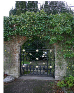
Above: Entrance to walled garden

This area is the walled garden located to the north of the house. It contains formal hedges of yew, box holly, beech, and fruit trees and is enclosed by high brick walls. There is a pre-existing rail order, which could result in the loss of the garden and its incorporation into the Carrickmines park and ride facility. To date the scheme has not been put into operation, with permission recently granted for a temporary car park in the former paddock area to the east of Priorsland House.