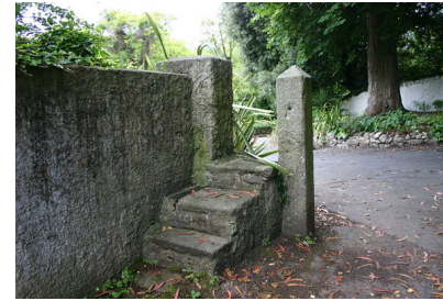
Above: Stile to rear of Cherrywood House

The Cherrywood area has been largely untouched by modern development and hence it has a very rich architectural, historic, social and agricultural heritage. There are a number of miscellaneous items of heritage interest such as street furniture and agricultural features whose retention should be incorporated into any development proposal.