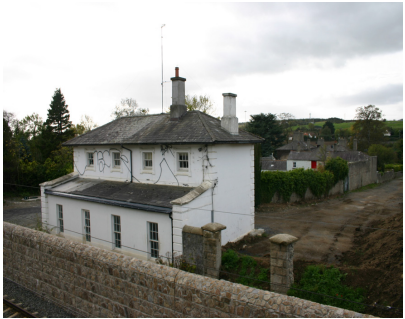
Above: Northern view of building

While the station building remains, it has lost its original context. The line of the original track is now part of the extension to the Luas Line B1. A number of associated elements were removed to make way for the Luas works. These include the original railway bridge that carried Glenamuck Road, and the granite bullnosed coping stones from the platform edges. The latter remain in a field to the south of Priorsland House.