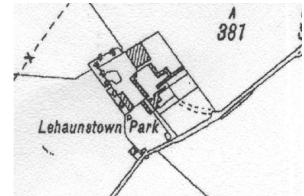
Above: Ordnance Survey Map, 1937