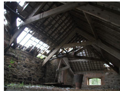
Above: Hay loft with A-truss timber roof

From the mid 19th century the house and lands have been in agricultural use. This history can be traced in the Ordnance Survey Maps of the site, which show the development of extensive ranges of out buildings. The only surviving structures comprise an L-shaped two-storey range. They are two-storey in height of granite rubble construction with red brick dressing the window and door openings. There are not many examples of this extent and quality remaining in Dún Laoghaire-Rathdown.