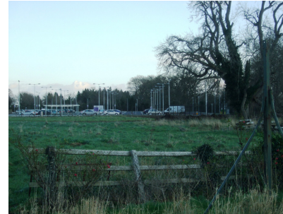
Above: paddock area to the front of Priorsland, prior to the insertion of the temporary car park at right