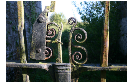
Above: Details of ironwork on gates