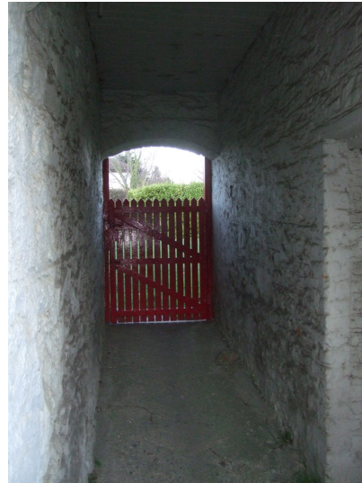
Above: Entrance from stable yard to gardens

The stable yard at Priorsland is one of the best surviving examples of its type in the County comprising a variety of buildings including stable building with timber boxes, a range of carriage sheds and two single-storey cottages. As stated previously there are many examples of how these types of structures can be successfully adapted without compromising their historic and architectural character.