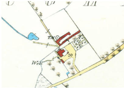
Above: Ordnance Survey Map, 1864