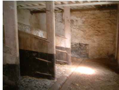
Above: Interior of stables with cobbled floor