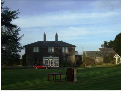
Above: Eastern elevation of Priorsland

The lands around Priorsland can be divided into three Character Areas. These areas are identified as follows: