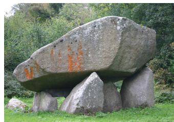
Above: Brennanstown Dolmen