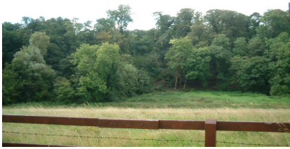
Above: View from the front of Glendruid