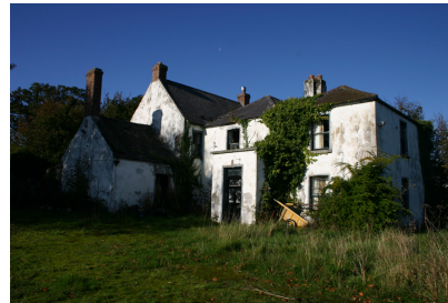
Above: Southern elevation of Lehaunstown Park