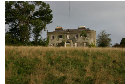
Above: View of front of Glendruid

The house itself is five-bay two-storey over basement with a projecting entrance porch, and a bow on its eastern side. It is set on an elevated site within its own mature grounds overlooking Carrickmines River Valley. The house is accessed via the original gated entrance, which includes a single-storey gate lodge. There is an interesting range of outbuildings to the rear of the house, which are accessed through a tall granite arched gateway. The site is bounded by a combination of high stone walls, mature trees and hedges, giving it a great sense of enclosure.