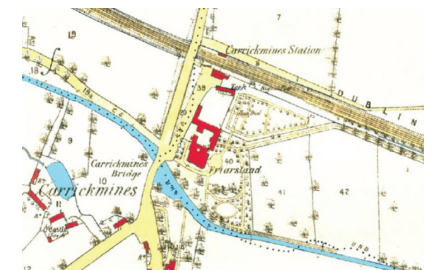
Above: 1864 Ordnance Survey Map

Carrickmines Station (located to the north of Priorsland House) was part of the original Dublin and Wicklow Railway (often referred to as The Harcourt Street Line), which ceased operation in 1958. It is a three-bay two-storey hipped roof structure having a moulded arch feature over the doorway. The former lean-to canopy to the rear elevation has been infilled to internalise the space. The building, although vacant, is in a reasonably good condition, and retains many original architectural features. One such feature is a former water tank, a remnant from the steam age.