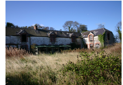
Above: View of northern end of outbuildings