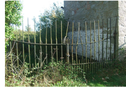
Above: Gate to farm complex

As with those at Glendruid and Priorsland, there is potential to conserve and adapt these buildings to provide new uses.