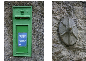
Post box and ironwork adjoining entrance to Glendruid