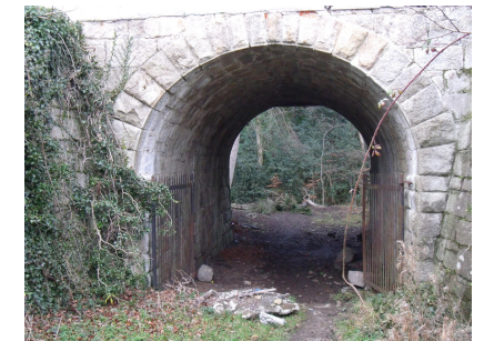
Above: Pedestrian undeTIIs close to Brennanstown Luas stop

The Second entry 332 is a pedestrian undeTIIs, which originally passed under the Harcourt Street railway embankment (now under the Luas line) and connected Glendruid to fields to the south.