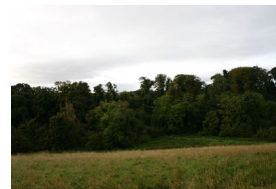
Above: Southern view from Glendruid to be protected