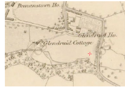
Above: Glendruid Estate, First Edition 6" Ordnance Survey Map, 1843

Within the attendant grounds of the original estate was Brennanstown Dolmen. The Dolmen is located close to the Carrickmines River, and has a very impressive capstone, which weighs 45 tonnes. The Dolmen is no longer within the Glendruid landholding. Further details of the Dolmen, including a photo, are in Part 1 of the appendix.