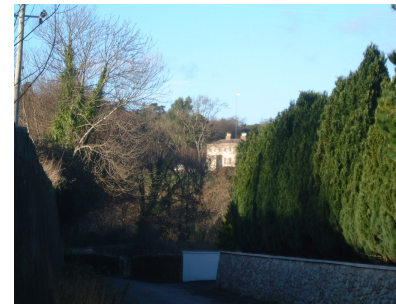
Above: Glendruid from Lehaunstown Lane

The southeastern portion of the site is very open when viewed from the front of Glendruid, lacking the screening afforded the southwestern end. This part of the site also affords views of the original house outside of the site from Lehaunstown Lane. Development considerations in this area will be sensitive in design, siting, location and orientation so as to enhance and protect the special character of Glendruid and it's setting.