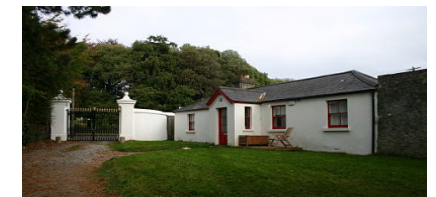
Above: Glendruid Gate Lodge