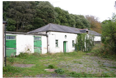
Above: Stables on western side of yard