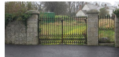
Above: Entrance gates with views towards Lehaunstown Park

This area includes Lehaunstown Park house, entrance gates, avenue and associated out buildings. Historically and architecturally, this is the most important area of the entire site. The entrance driveway is carefully aligned to offer glimpses of the house on approach. No development should be permitted between the entrance gates, driveway and the house as this would destroy the historic relationship.