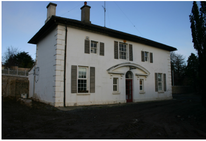
Above: Southern elevation of former station