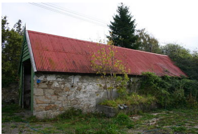
Above: Granite structure on northern side of stable yard

There is potential to conserve and adapt these structures to provide new uses. There are many examples of how these types of structures can be successfully integrated into a new development without compromising their architectural and historic character. For example, in Castlecomer in County Kilkenny, similar structures have been converted to a craft village. While in Narrow Water Castle in County Down, the original stable complex has been converted to self-catering accommodation retaining the original stalls as room dividers.