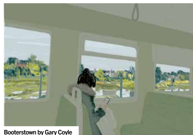
Boosterstown by Gary Coyle

In part inspired by Japanese Wood block prints of the 18th & 19th Centuries, they will be made on a computer using photo shop and a drawing tablet.