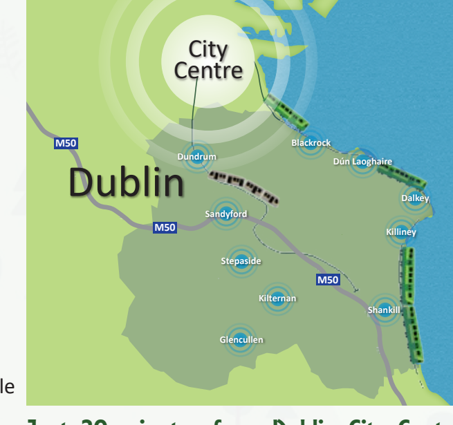
Just 20 minutes from Dublin City Centre

There are a host of free heritage tours and exhibitions to explain what connects the people and places in this unique part of Dublin. They are designed to help visitors uncover chapter and verse about the less well known aspects of our story as you go Between The Lines.