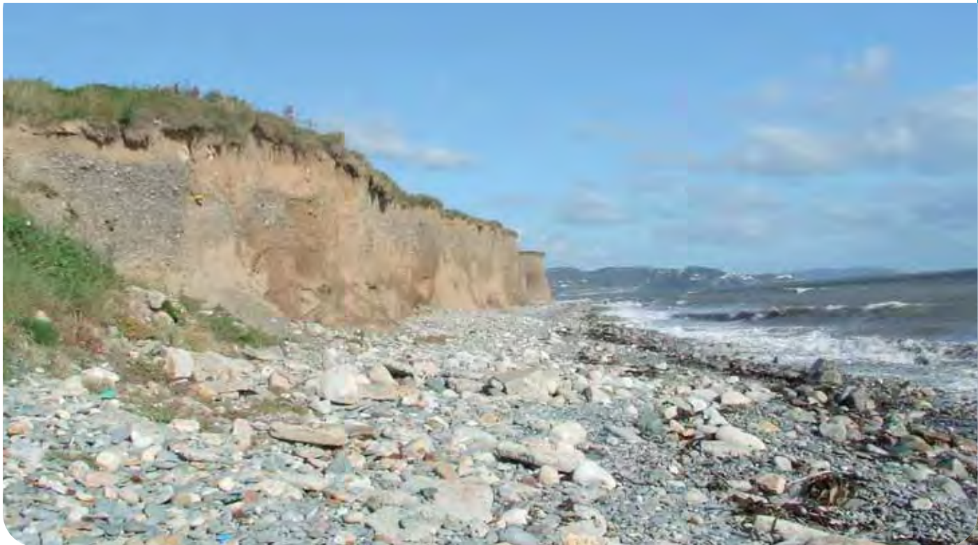
The Shanganagh Cliffs. Soft sedimentary cliffs such as these are particularly valuable as habitat for invertebrates