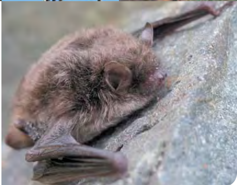
Right: Daubenton's Bat