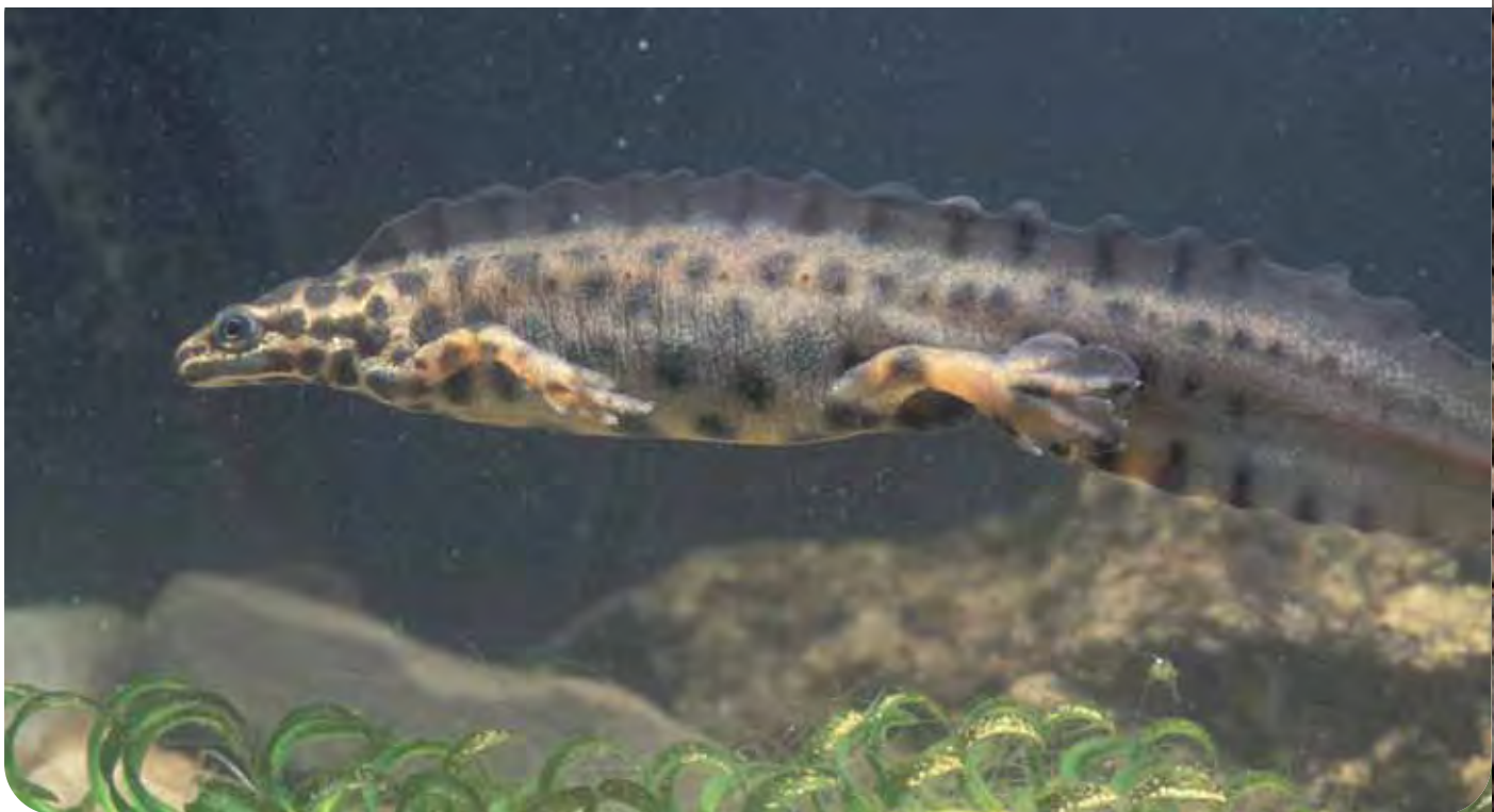
Smooth Newt – this species spends much of the year on land, with adults returning to ponds each spring to breed

Working closely with the successfully operating Heritage Plan for Dún Laoghaire-Rathdown, the target of the Biodiversity Plan is to create a vibrant and progressive environment in which to live and work, where the county's natural and built environment is valued, promoted and protected, both for people and wildlife.