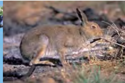
Above, left-right: Red Admiral; Song Thrush; Mountain Hare