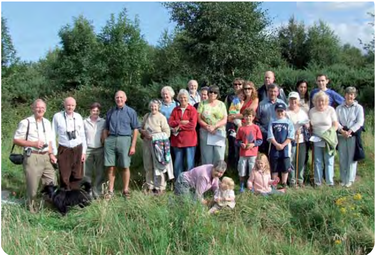
Local residents on a nature walk in Fitzsimons Wood

Where 'best practice guidelines' are promoted, training programmes will be developed to empower both Council staff and members of the public to enhance biodiversity in their own localities. More focused educational programmes will also be developed in conjunction with schools and other educational institutes to provide biodiversity training to interested parties.