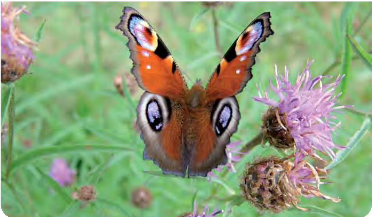
Peacock Butterfly foraging on Common Knapweed

While some of the high profile plant, bird and animal species (such as orchids, otters, bats, kingfishers and terns) are recognised for their intrinsic value, and are deemed to require particular protection and conservation measures, the value of a large number of 'common or garden' species tends to be underestimated. So-called ordinary species, such as common invertebrates, are frequently overlooked as targets for conservation management. Invertebrates are species which lack a backbone, and include most 'creepy crawlies' including bees, butterflies, flies, beetles, spiders, snails, woodlice, centipedes and worms.