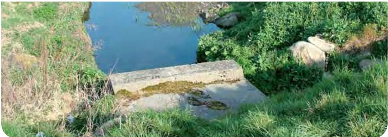
A culvert along the Deansgrange Stream. Culverting can lead to habitat loss and adverse changes to the structure and flow of watercourses

Sensitive approaches to planning for biodiversity in future domestic and commercial development can significantly help to reduce these impacts.