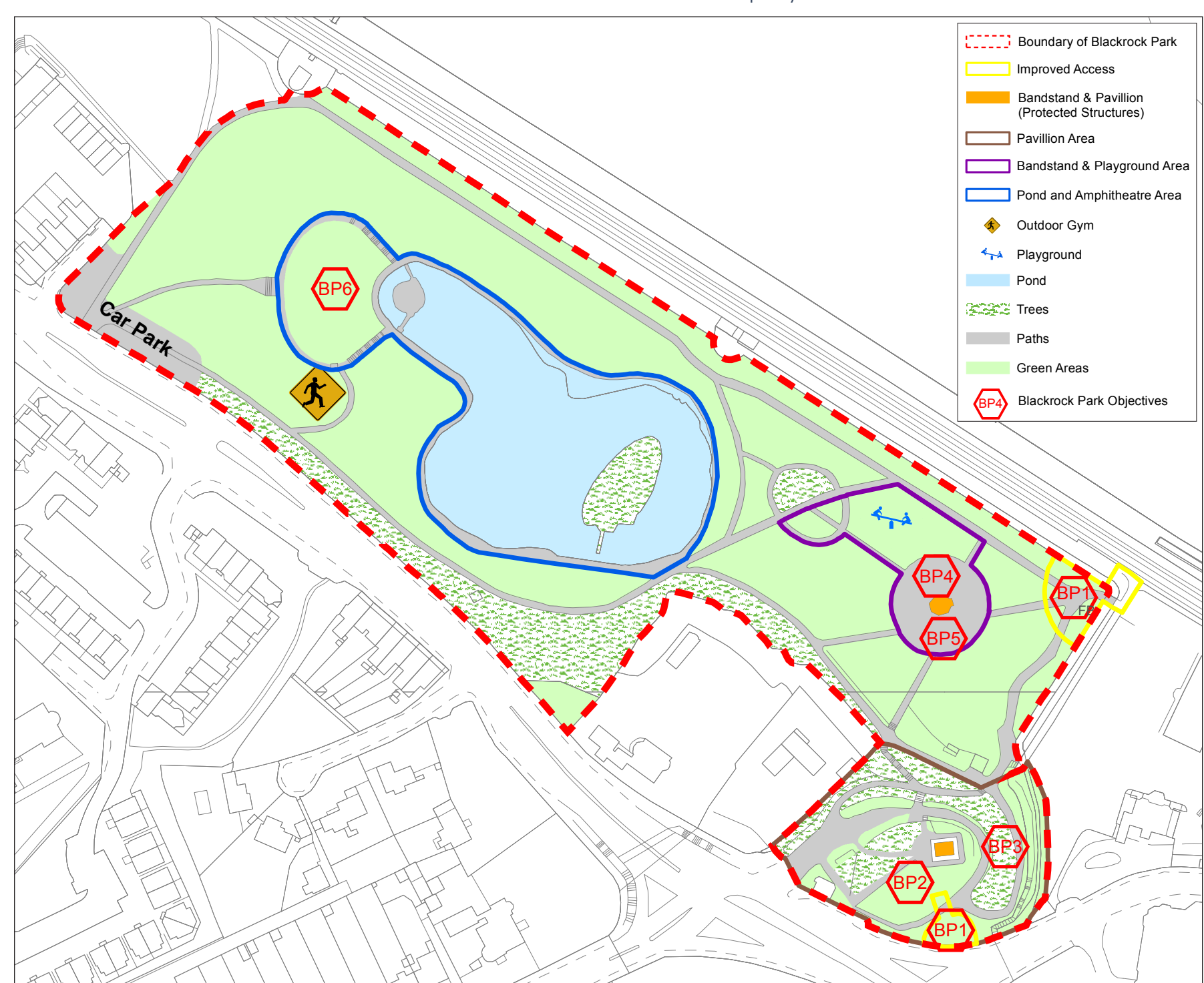
Map 17: Blackrock Park