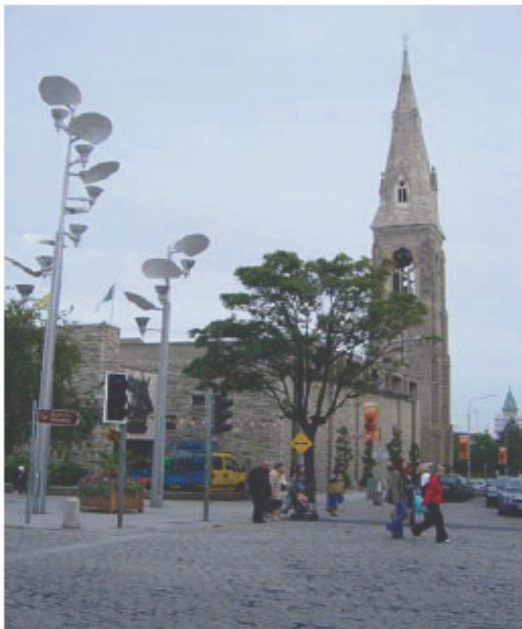
Existing Local Landmark in Dun Laoghaire

A local landmark is a single outstanding building, which is either, taller or of a more notable design than its neighbours, but has an impact only at local rather than at district or metropolitan level.