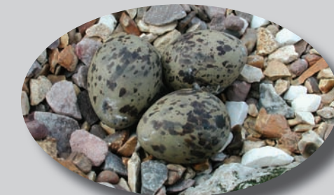
Common Tern eggs

Little Tern Distinguished by its small size and largely yellow bill with black tip. Unusual amongst terns in that it nests on mainland sand and shingle beaches such as at Kilcoole (Wicklow). Formerly nested on Dublin's Bull Island but now rarely seen anywhere in Dublin Bay.