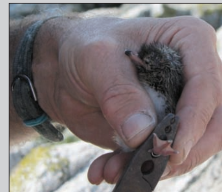
Putting a ring on a Roseate Tern chick on Maiden Rock, June 2010

young differ from the others in that they remain in the boxes until they are ready to fledge. During the course of the breeding season visits are made to Maiden Rock to weigh and measure chicks and fit them with uniquely numbered bird rings. Disturbance is kept to a minimum and no harm comes to the chicks during this procedure. Rings are very important in supplying valuable information about the birds' migration paths and their winter destinations.