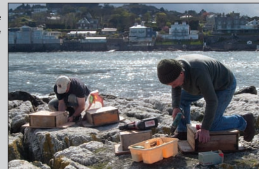
Securing nest boxes to Maiden Rock to prevent their loss during storms.

This post-breeding, pre-migratory congregation exploits an abundance of small fish in the greater Dublin Bay area in the late summer. During September all species head south, with Common and Roseate Terns wintering on the west coast of Africa while the Arctics continue on to the Southern Oceans in one of the longest known migratory journeys of any bird.