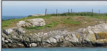
Fence erected for terns on Lamb Island.

connected at lower tide levels and thus 'share' a wholly introduced