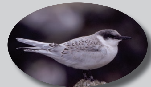
Juvenile Roseate Tern