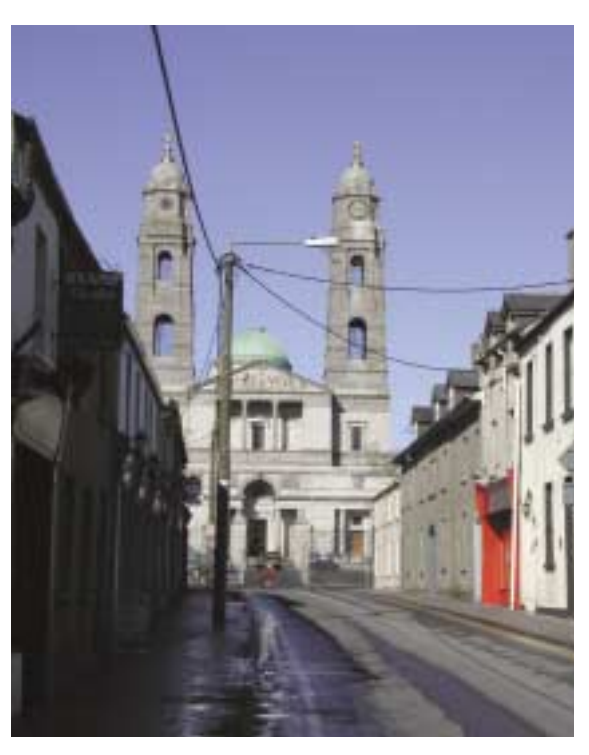
Although one or more outstanding buildings may form the nucleus of an ACA, the design and layout of all structures within the area will be important to establishing its special architectural interest

Many buildings were consciously designed to 3.3.2 contribute visually to the character of their setting, beyond the boundaries of the curtilage on which they were built. They respond to the street, road or landscape in which they are situated. Later rebuildings on a mediaeval curving street, visible perhaps in faceted façades and narrow plots, relate to the communal history of settlement in a town. Subtle repetitive patterns of chimneys, window or door-openings on a street, where traditional construction methods used a shared palette of materials, can give the area character and a sense of scale and harmony. The volume or massing, plot size, boundary alignments and street-frontage alignment of the built environment can be part of the heritage of an urban area.