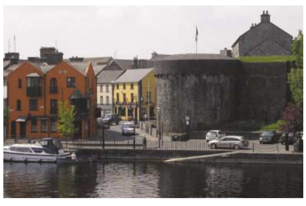
Historic town or village cores are often appropriate to designation as ACAs

a) groups of structures of distinctiveness or visual richness or historical importance;