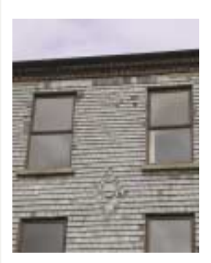
Conscious artistic input can bring special interest to otherwise ordinary structural elements such as slate-hanging, brickwork, chimneystacks or shopfronts within an area

The consistent use of crafted materials, such as paving or walling in local styles or materials, can contribute to the special artistic interest of an area, for example the use of Moher 'slate' roofs in Ennistymon. Styles of decoration such as moulded terracotta embellishments can be very characteristic of late nineteenth-century terraces.