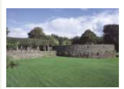
The formal garden at Heywood, Co. Laois is a work of art by an outstanding architect, Edwin Lutyens. Many well-designed memorials, gardens and public spaces are of artistic interest whether or not their designer is known

Public sculpture, utilities or memorials, as well as being works of art in their own right, can be the artistic focus of a public space which has been formally designed to present them. A formally laid out landscape or townscape could also be of artistic interest. This may include the radial streets or avenues on the baroque model which set up vistas of important structures within an area such as in the layout of the village of Portlaw, Co. Waterford.