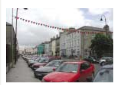
Policies on traffic control and car-parking can affect the character of an ACA

character of the area should also be noted. This could include buildings or derelict sites that have a clearly detrimental effect on the character of the area. Other aspects of an area which detract from its character could include excessive traffic or intrusive traffic signage, advertising hoarding, inappropriate replacement windows and the like. The planning authority should consider the appropriate steps open to them to minimise or avoid these. Policies or objectives could be adopted for the replacement of structures or features that are unacceptably intrusive, where their replacement or substantial alteration would improve the character of the area as a whole.