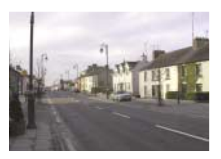
Traffic management projects should aim to present the area to its best advantage whilst providing a service to both inhabitants and visitors