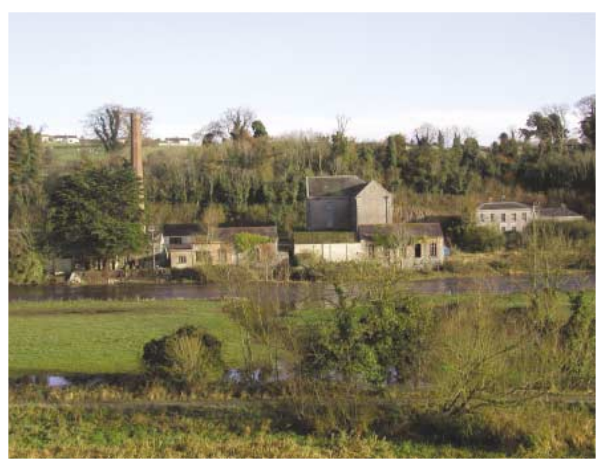
These mill buildings at Slane Bridge are of outstanding importance as an example of an early purpose-built industrial complex dating from the start of the Industrial Revolution