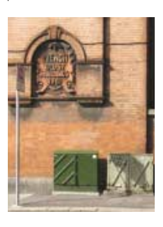
Care should be taken within an ACA regarding the siting of structures related to public utilities and traffic management

3.11.1 The planning authority should consider taking an active approach to the conservation and management of ACA, in particular through works carried out by the planning authority itself and by public utilities. Consideration should be given as to how to manage infrastructural developments, street or road openings. The location and form of street furniture such as telephone kiosks, bus stops, street lights, traffic signage, street nameplates, together with any proposed alteration to existing historic furniture, have the potential to impact upon the character of the area, as does the location of power and telephone cables. Paving should be carefully considered, in particular where good examples of stone paving and kerbstones exist in situ. Wider issues such as road-widening, bypasses and other large-scale infrastructural developments adjacent to an ACA may also have an impact on its character or patterns of use.