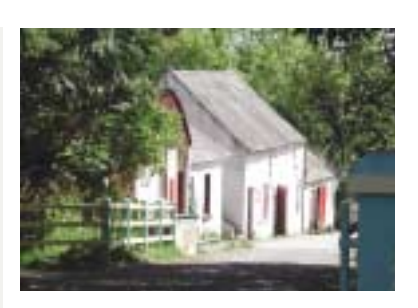
In rural areas, former settlements or groups of buildings can survive substantially intact thus adding to the special historical interest of the area