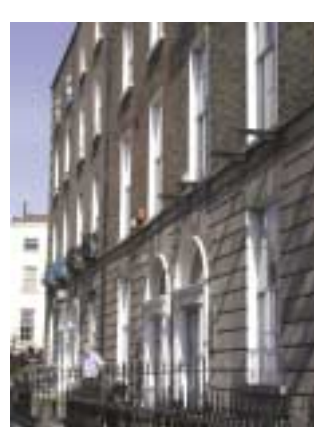
The survival of distinctive materials and local detailing can add to the character of an ACA including joinery patterns, paving materials and boundary railing styles

3.2.5 The boundaries of a candidate ACA should make physical, visual and planning-control sense. It may be necessary to refer back to the core characteristics of the area in order to establish the most appropriate boundary lines. The choice of boundary may be influenced by considering the importance of the various views into and out of the area, but it is not necessary to include all territory encompassed by such views. The character of the edges of the area may gradually degenerate in some parts due to dereliction. Whether or not degraded parts should be included may be resolved by reference to the historical research to see if these areas once formed a coherent part of the overall place.