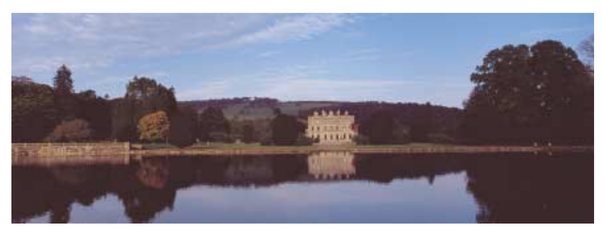
Areas of architectural heritage significance may coincide or overlap with those of natural heritage importance. In the case of this demesne, the trees of the estate are subject to a tree preservation order

The Act provides powers to planning authorities not only to conserve the character of certain areas but also, in urban areas of special importance, to enhance that character; that is, to restore it and to require owners and occupiers to conform to a planning scheme. The area must be all or part of an ACA of special importance to the civic life of the city or town or to the architectural, historical, cultural or social character of the town or city in which it is situated. The designation of an area of special planning control may only be applied in cities or larger towns, that is, in county boroughs, boroughs, urban districts or towns having town commissioners that have a population in excess of 2,000.5