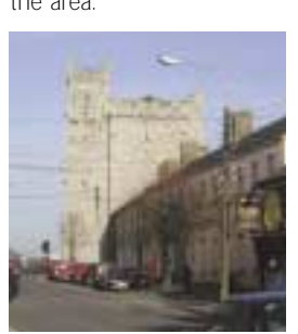
An ACA may be designated for its special archaeological interest where upstanding archaeological remains survive and such an area may therefore overlap or coincide with statutory protection under the National Monuments Acts

3.3.6 The retention of archaeological deposits in situ, with targeted excavation and conservation projects, is recognised as an important strategy for securing more knowledge about the past. In urban areas, this consideration may inform a conservation strategy for the standing structures above. An ACA may coincide with a zone of archaeological potential or an archaeological area. In these cases, care should be taken to ensure that the conservation policies adopted successfully mediate between the different pressures and requirements of both the aboveground and below-ground structures. It often transpires that structures which have been substantially rebuilt above ground retain their mediaeval basements, as for example in the historic centre of Kilkenny. The recognition of such fabric, especially within an area which retains its burgage plots or defensive structures, may be vital to gaining an understanding of the archaeological character of the area