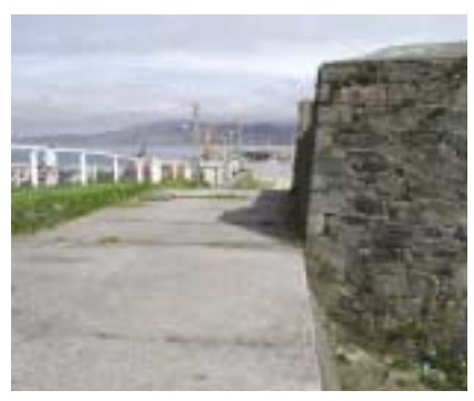
The setting of an area, together with views in and out of it, can contribute greatly to its overall character and should always be considered when assessing its importance

The contribution of setting to the character of the 3.4.2 architectural heritage should not be underestimated. A building in a rural setting may have a different, but equally noteworthy, relationship with its surroundings from that of a building in an urban place. The location of a structure may have been designed to relate to a particular landscape feature, as, for example, in the way that Powerscourt House relates to the Sugarloaf Mountain. Follies, eyecatchers, gazebos and towers were all usually positioned and designed to enhance their setting or the designed landscape in which they are situated. The attendant grounds around a country house were often moulded into a coherent landscaped entity in accordance with current aesthetic and economic ideas.