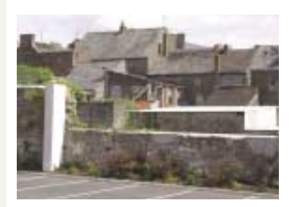
The boundaries of an ACA should make physical and practical planning sense and may need to be defined with the help of historical research especially in urban areas

3.2.5 The boundaries of a candidate ACA should make physical, visual and planning-control sense. It may be necessary to refer back to the core characteristics of the area in order to establish the most appropriate boundary lines. The choice of boundary may be influenced by considering the importance of the various views into and out of the area, but it is not necessary to include all territory encompassed by such views. The character of the edges of the area may gradually degenerate in some parts due to dereliction. Whether or not degraded parts should be included may be resolved by reference to the historical research to see if these areas once formed a coherent part of the overall place.