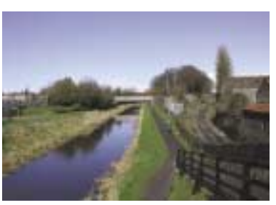
The special technical interest of an area may derive from its association with industrial heritage areas or landscapes such as harbours, ports, railways and canals

3.3.12 At Portlaw, Co. Waterford, a town designed around the production of cotton, the landscape of the vicinity of the industrial site was moulded by its processes. There are weirs, mill-races, a tailings pond and a canal. In contrast, the industrial heritage of Monivea, Co. Galway is now evident mainly from the wide village green, which was created as a flax-drying green in the late eighteenth century, laid out on axis with the castle entrance.