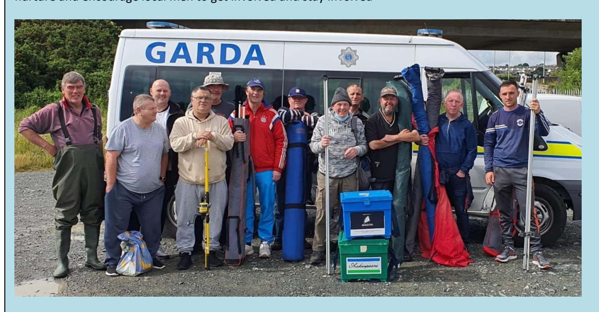
Pic: LBS Mens Shed social fishing outing supported by Gardaí Community Policing Team

The SICAP team in Holly House (HH) have formed a strong relationship with the LBS Mens Shed spanning over 8 years, allowing leaders in the group to grow and develop both their own skills and knowledge but also nurture and encourage local men to get involved and stay involved