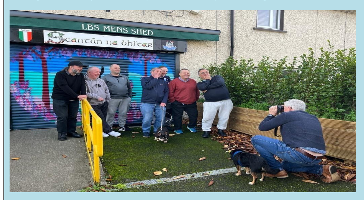
Pic: Launch of LBS Creative Shutter Art Programme supported by DLR Arts Office

The Mens' Shed in partnership with Holly House and DLRCC Arts Office worked together to support the men to engage in 2 art initiatives, the first was to design and spray paint their shutter on the shed with a design that represented their ethos; the second was to work with a spoken word artist, the aim of this initiative was to encourage the men to express their life experience and shed experience through words.