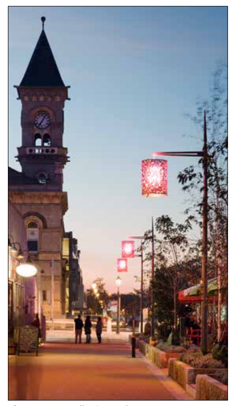
Above: County Hall, Dún Laoghaire

The Planning process is an open and public one. In that context, all submission documents are made available for public inspection. This information may also be placed on the Council's website.