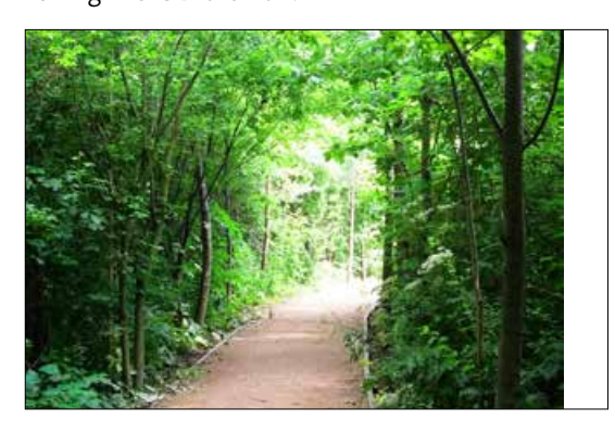
Above: Marlay Park

business support for start-ups, attraction of Foreign Direct Investment, growth of the existing SME sector and securing the vitality and viability of retail centres throughout the County are given particular focus. The importance of Third Level Institutions to the economy of Dún Laoghaire-Rathdown is also recognised and these have been afforded a distinct zoning in the Draft Plan.