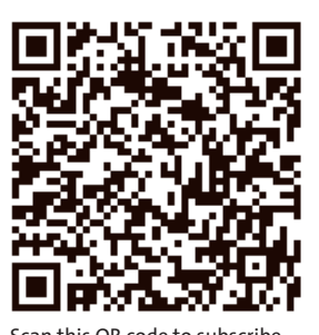
Scan this QR code to subscribe to the dirtimes by email