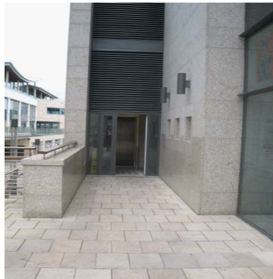
Photo 4.2 Access for All Elevators at Dundrum Shopping Centre