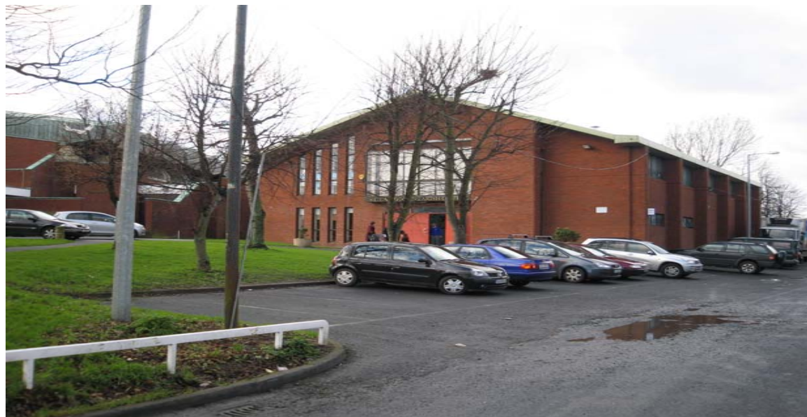
Photo 4.1. St Laurence's Community Centre