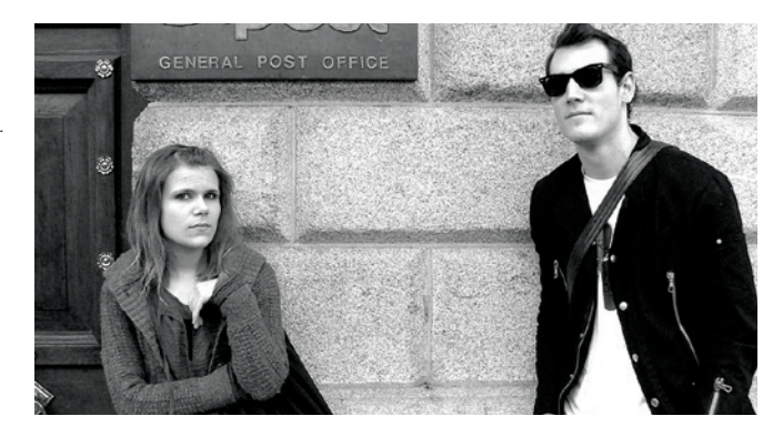
ABOVE Still from Dublin Only by Piotr Sadowski (2011)

The show follows the lives of two girls by way of a bus journey. We first meet them in 1954 as 12-year olds. The bus conductor, a large puppet, constantly talks to the audience. With every ring of the bell, the calendar jumps, the girls get older, as do the audience. Free admission but booking advisable for both performances on Eventbrite.ie . Search for Fuss on the Bus.