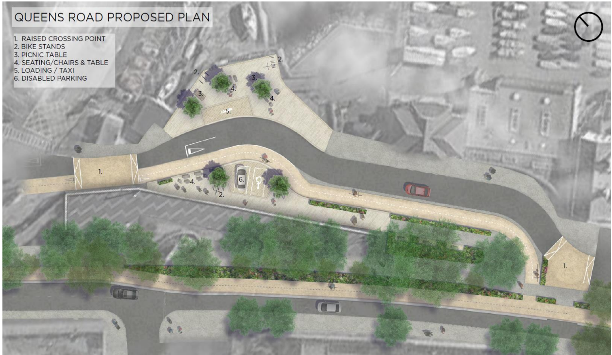
Figure 3 Proposed future layout of Mailboat Plaza (subject to PP)

Subject to planning approval, Dún Laoghaire-Rathdown County Council will divert this roadway away from the units to create a pedestrian plaza immediately in front of the subject bays.