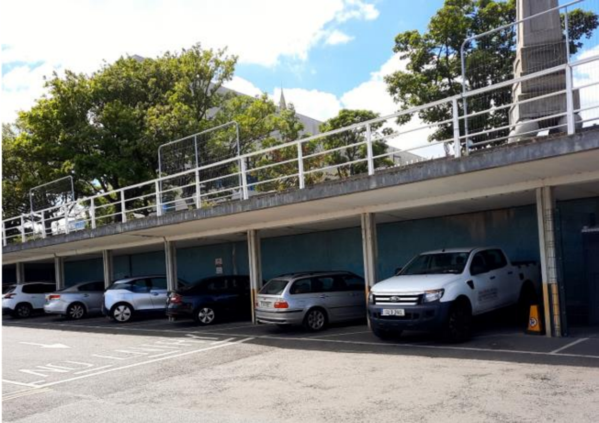
Figure 1 - Former parking bays at Mailboat Plaza

Unique opportunity to occupy former parking bays at the Mailboat Plaza, Dún Laoghaire, Co. Dublin