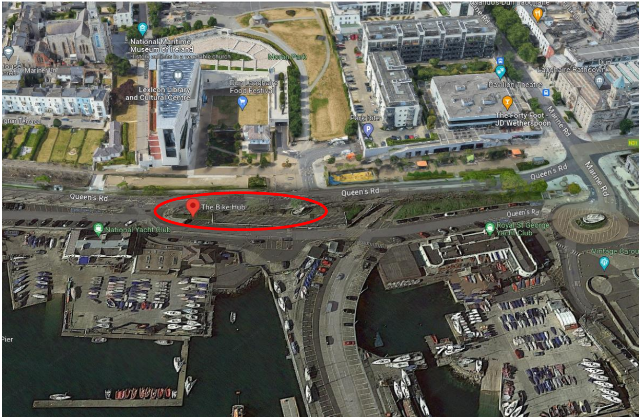
Figure 2 Location of parking bays

The parking bays are located on the Mailboat Plaza at the base of the Carlisle Pier, an area between the Royal St. George Yacht Club and the National Yacht Club. The roof over the bays forms a balcony which is level with Queens Road. The balcony is home to the King George IV monument and the anchor of the RMS Leinster and is overlooked by the landmark Lexicon Library and Cultural Centre.