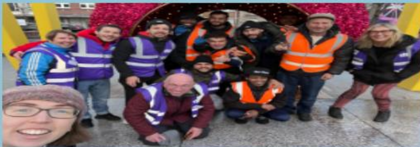
Pic: DLR Volunteer Centre out recognising the huge contribution of Dún Laoghaire Tidy Towns volunteers to our local area.

Volunteering in Dlr Highlights from 2023