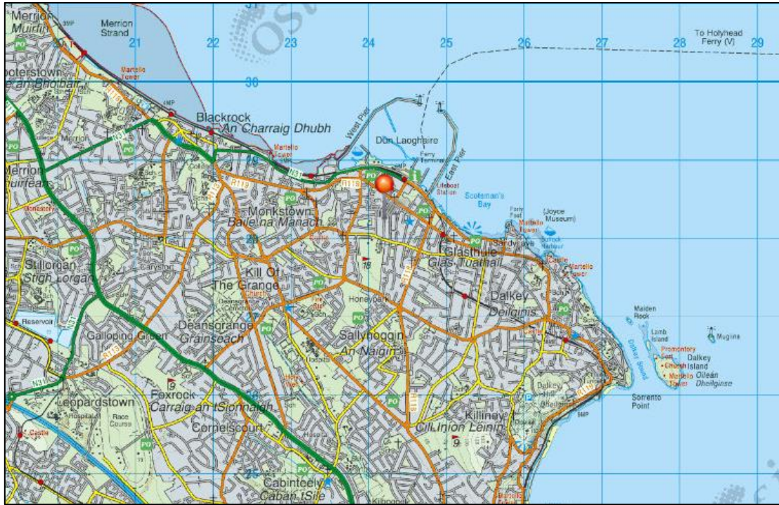
Figure 3 – Site Location Map. Application Site (Both Permanent and Temporary Sites) are Outlined in Red.