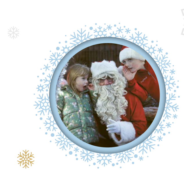
A special visit with Santa at the National Maritime Musuem

Visitors will also have the unique opportunity to ride a 35-metre-high observation wheel for panoramic views of the illuminated landscape below. <a href="https://www.wonderlights.ie">www.wonderlights.ie</a>