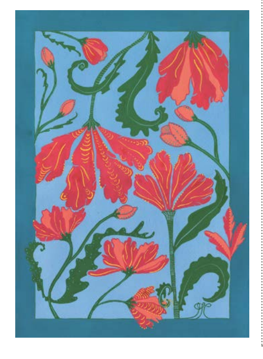
Image courtesy of Hannah-Clare de Gordun who will be facilitating an 'Introduction to Gouache Painting' Workshop on 7 December.

Workshops for adults are bookable on <a href="www.eventbrite.ie">www.eventbrite.ie</a> by searching for dlr Lexlcon Gallery.