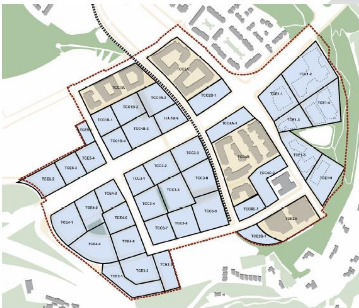
Figure 2: Town Centre Core and Town Centre Environs Parcels

Parameters and guidance for development are provided at Superblock level, rather than the individual urban block level. This allows flexibility in delivering quality development and design solutions. The Urban Development Code sets out specific parameters and guidance on the nature, extent and distribution of development within the Superblock. Important streets and spaces, located within and between Superblocks, are included in the Street Code and the Urban Space Code.