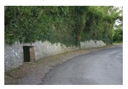
Above: Possible well, Lehaunstown Lane

There are two surviving notable entries from the Industrial Heritage Survey located in the Cherrywood SDZ boundary namely numbers 992 and 632. Number 992, which is entered as a possible well. This is a recess in the wall on the south side of Lehaunstown Lane in the vicinity of a sharp bend. The Archaeological Study on RMP 026-127 concluded that "A well built into the northern boundary wall of the road, to the northwest of the lane entrance, was probably constructed when the road was realigned in the late 19th /early 20th century." This may have been a superstructure over a natural spring to retain access to the spring once the road was realigned. There is no holy well tradition associated with this well however, given the proximity to the Tully ecclesiastical complex this should not be ruled out.