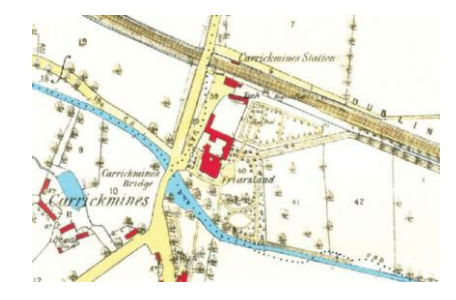
Above: 1864 Ordnance Survey Map