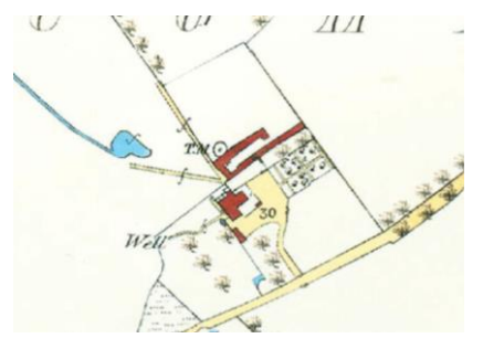
Above: Ordnance Survey Map, 1864