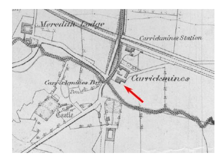
Above: First Edition 6" Ordnance Survey Map, 1843

Despite historical research, it is unclear when the original house at Priorsland was built (Historical and Architectural Heritage Report). What is clear is that the dwelling does appear on the First Edition Ordnance Survey Map of the area published in 1843. This map also shows the extensive courtyard of out buildings, which still stand today. The house was enlarged in the 1860s, with new sections added on the eastern and north eastern sides together with a new front.