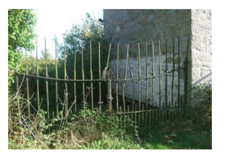
Above: Gate to farm complex

As with those at Glendruid and Priorsland, there is potential to conserve and adapt these buildings to provide new uses.