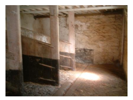
Above: Interior of stables with cobbled floor