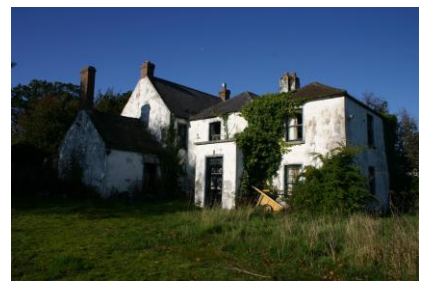
Above: Southern elevation of Lehaunstown Park