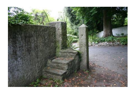
Above: Stile to rear of Cherrywood House

The Cherrywood area has been largely untouched by modern development and hence it has a very rich architectural, historic, social and agricultural heritage. There are a number of miscellaneous items of heritage interest such as street furniture and agricultural features whose retention should be incorporated into any development proposal.