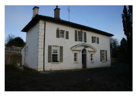
Above: Southern elevation of former station