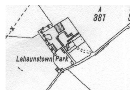
Above: Ordnance Survey Map, 1937