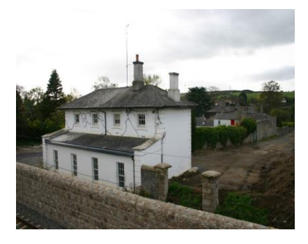
Above: Northern view of building

While the station building remains, it has lost its original context. The line of the original track is now part of the extension to the Luas Line B1. A number of associated elements were removed to make way for the Luas works. These include the original railway bridge that carried Glenamuck Road, and the granite bullnosed coping stones from the platform edges. The latter remain in a field to the south of Priorsland House.