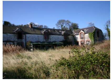
Above: View of northern end of outbuildings