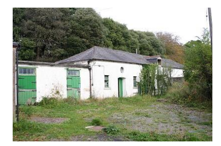
Above: Stables on western side of yard