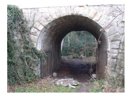
Above: Pedestrian undeTIIss close to Brennanstown luas stop

The Second entry 332 is a pedestrian undeTIIss, which originally passed under the Harcourt Street railway embankment (now under the Luas line) and connected Glendruid to fields to the south.