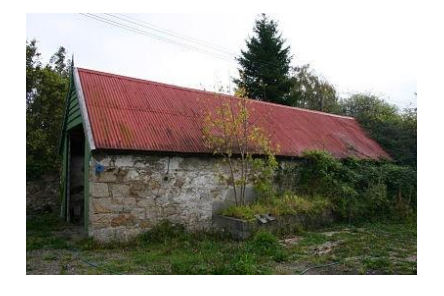
Above: Granite structure on northern side of stable yard

There is potential to conserve and adapt these structures to provide new uses. There are many examples of how these types of structures can be successfully integrated into a new development without compromising their architectural and historic character. For example, in Castlecomer in County Kilkenny, similar structures have been converted to a craft village. While in Narrow Water Castle in County Down, the original stable complex has been converted to self-catering accommodation retaining the original stalls as room dividers.