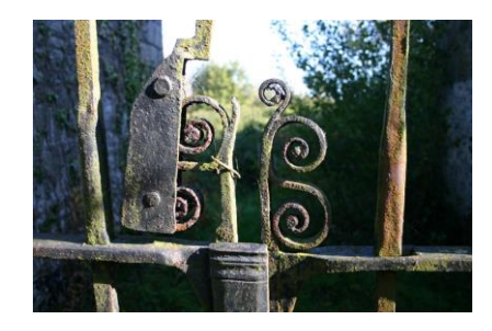
Above: Details of ironwork on gates