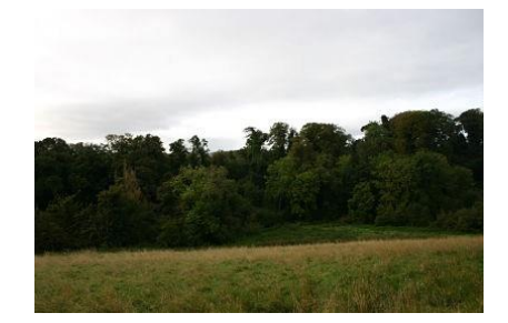
Above: Southern view from Glendruid to be protected