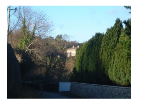
Above: Glendruid from Lehaunstown Lane

The southeastern portion of the site is very open when viewed from the front of Glendruid, lacking the screening afforded the southwestern end. This part of the site also affords views of the original house outside of the site from Lehaunstown Lane. Development considerations in this area will be sensitive in design, siting, location and orientation so as to enhance and protect the special character of Glendruid and it's setting.