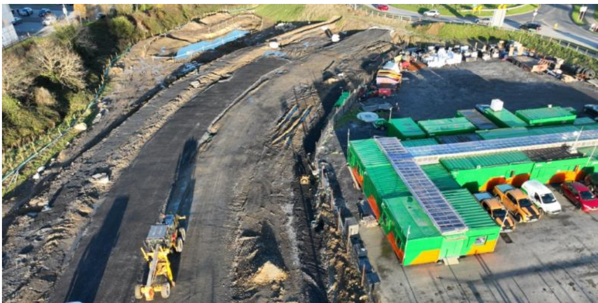
Site Compound at Carrickmines

https://www.dlrcoco.ie/capital-programme/glenamuck-district-roads-scheme