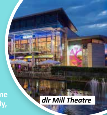
dlr Mill Theatre

Founded in 1982, Dún Laoghaire Choral Society is an amateur choir of over 70 singers that performs a rich variety of choral music from medieval to classical and contemporary pieces, including newly commissioned works. www.dlcs.ie/upcoming-events