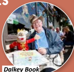
Dalkey Book Festival

Along Dublin's south coast, numerous book festivals and literary events celebrate the best in Irish and international writing. Contact the Tourist Information Kiosk in Dún Laoghaire for details and dates.