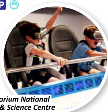
Explorium National Sport & Science Centre

Science and sport combine to offer engaging and educational interactive activities for inquisitive minds of all ages. Every visit to Explorium will be a different and life-enhancing experience. www.explorium.ie