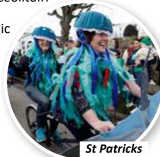
St Patricks Day Parade

Discover the history and heritage of traditional Irish music and dancing. Visit the headquarters of Irish music association Comhaltas Ceoiltoiri Éireann in Belgrave Square Monkstown. Open to the public every night from 6.30 pm, the Comhaltas HQ offers roaring fires, excellent pints and traditional Irish music sessions in a very convivial atmosphere. +353 (0)1 280 0295, www.comhaltas.ie