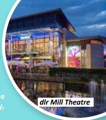
dlr Mill Theatre