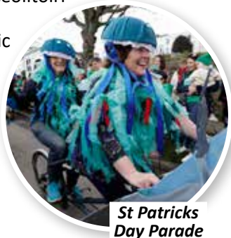
St Patrick's Day Parade