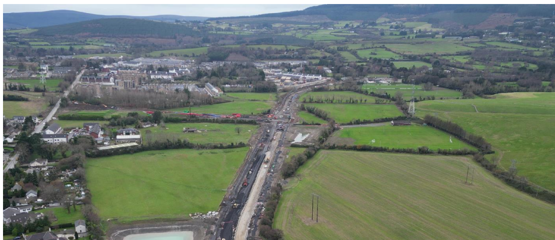
A view of the GDDR looking west from Carrickmines Retail Park

https://www.dlrcoo.ie/capital-programme/glenamuck-district-roads-scheme