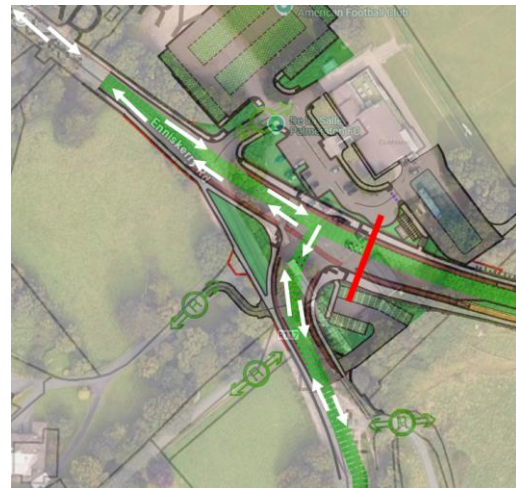
Two way April 2025