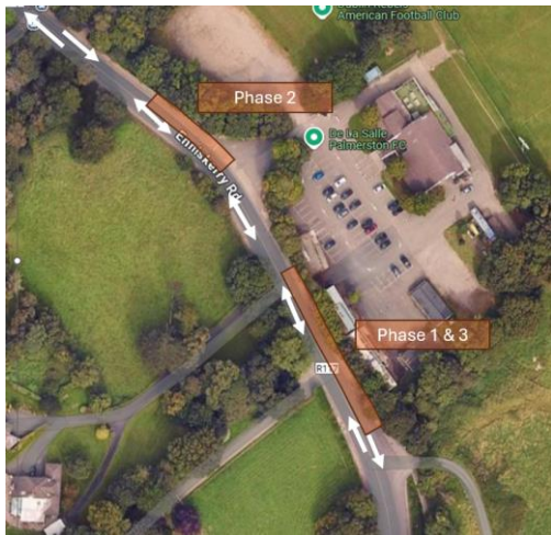
One way (Stop-Go) Feb to March 2025