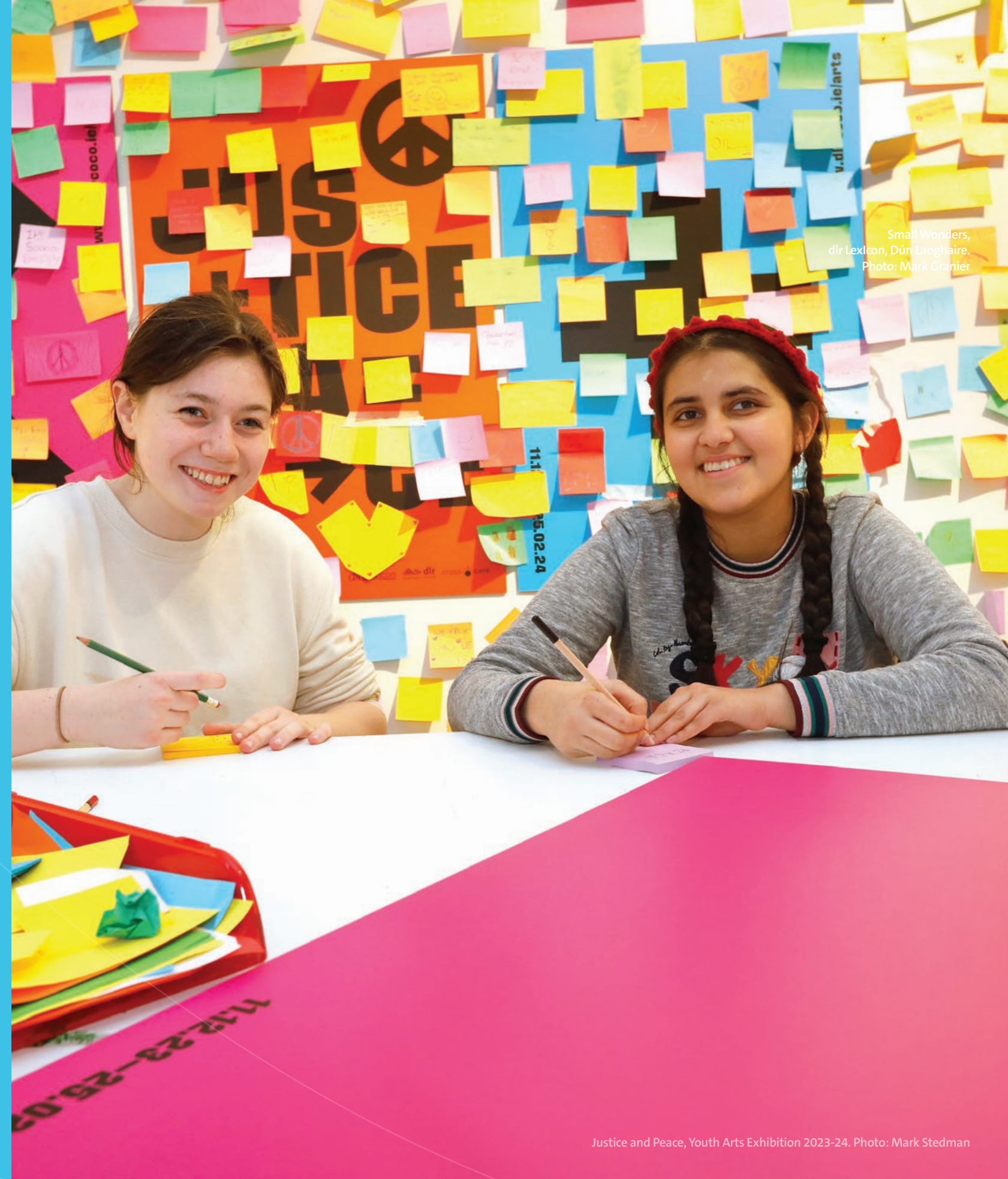
Small Wonders, dIrl Lexicon, Dún Laoghaire.