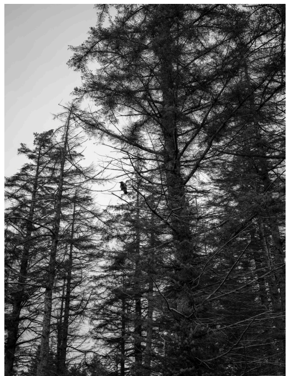
Ticknock no 3 from the series Silva, Martin Healy 2024. © Martin Healy

The project should include events for the public, held in the forest, or near the forest in a location agreed with project partners. These events could include guided walks, performances, workshops, or talks. We are open to these taking place over the period from September to November. We are open to artists building on existing research or work that connects directly to this project. As the events will be outdoors during autumn and early winter, proposals should take seasonal weather conditions into account.