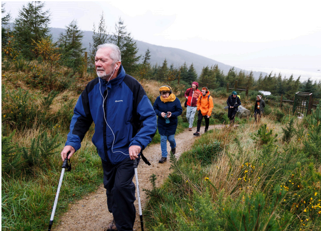
Ticknock: What's Going On? By Listen and Breathe, 2024.

We welcome applicants who represent the diversity of Irish society. We encourage applications from all areas of the community regardless of your gender, sexual orientation, civil or family status, religion, age, disability, race or membership of the Traveller Community, or socio-economic background.