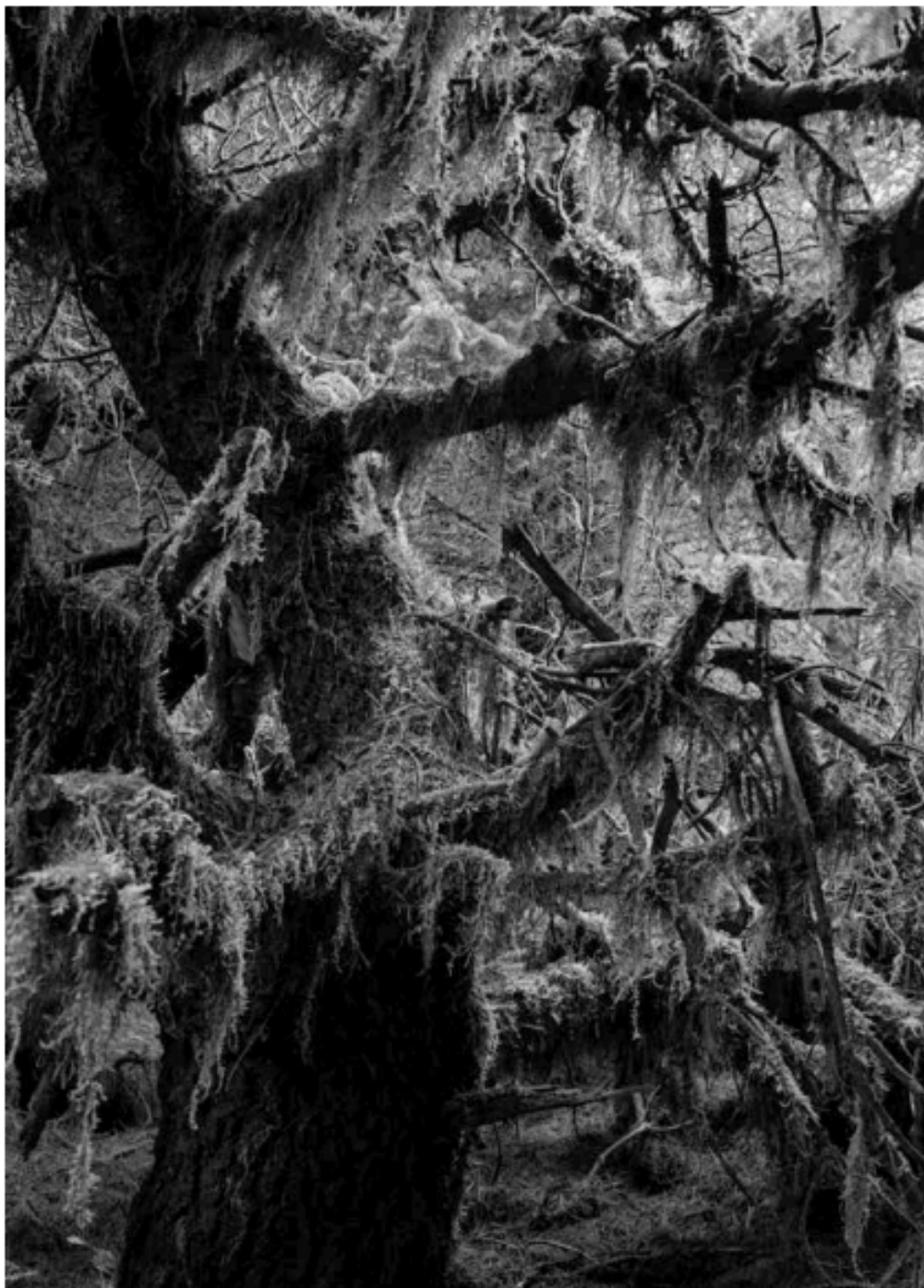
Ticknock no 10 from the series Silva, Martin Healy 2024.

www.dlrcoco.ie/arts arts@dlrcoco.ie (01) 2362759