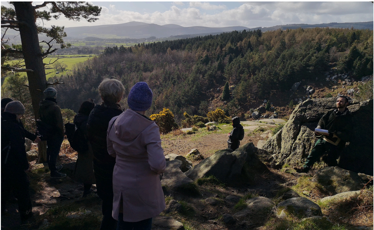
ReRoot performance, Barnaslingan Forest 2024.

This project is funded by Creative Ireland, Dún Laoghaire-Rathdown (DLR) County Council and the Dublin Mountains Partnership. It is managed by DLR Arts Office and supported by Coillte.