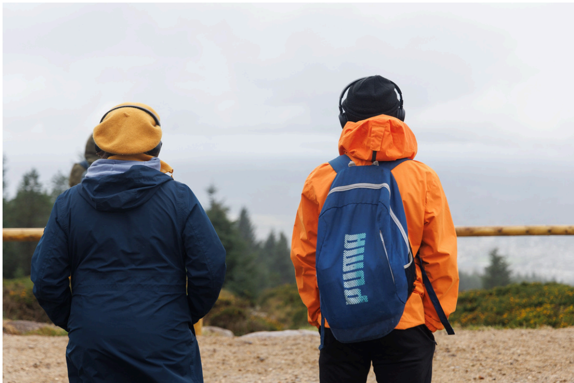
Ticknock: What's Going On? By Listen and Breathe, 2024.