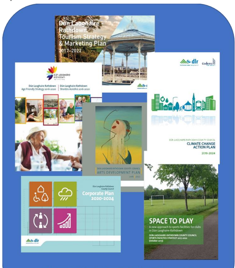
Fig 1: Some DLR policy documents that sit alongside the County Development Plan

the County and traffic were also raised, there was a keen awareness and understanding that in addressing Climate Action compact growth is important.