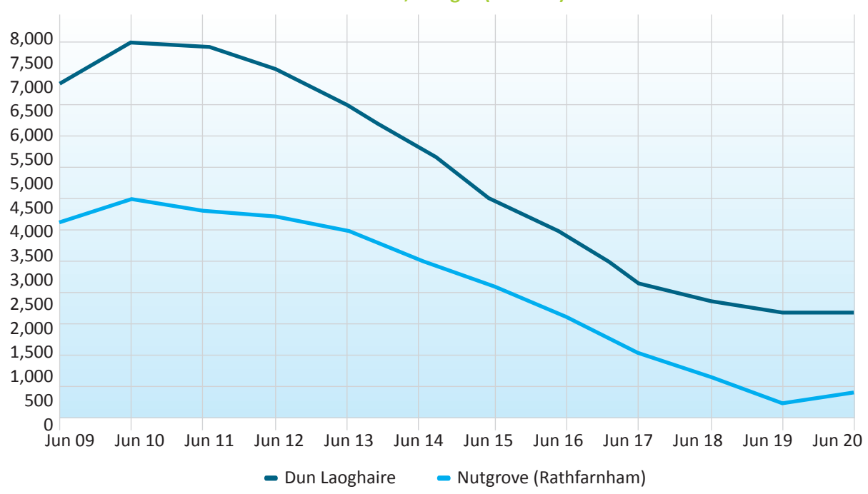
Figure 6.1: Persons on the Live Register