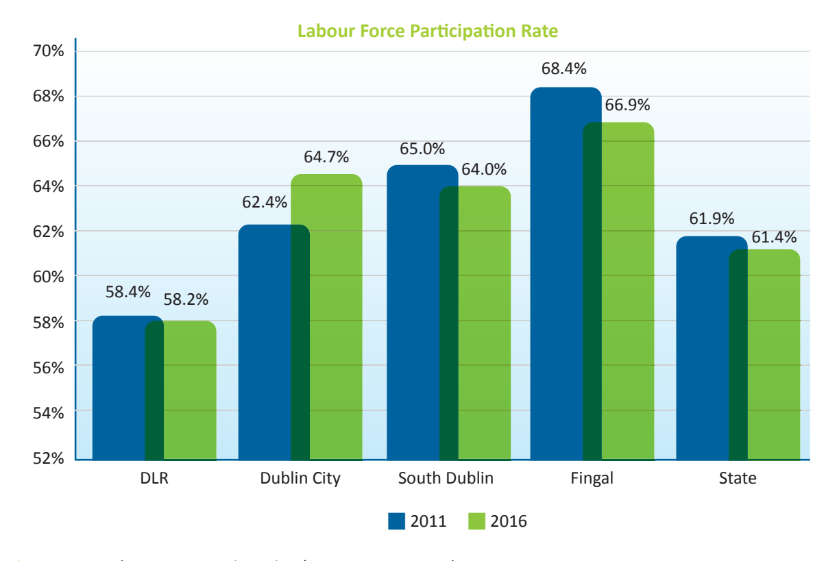
Figure 6.2: Labour Force Participation (Source: CSO Census)

When assessing the characteristics of the labour force in DLR, two factors stand out: the relatively low labour force participation rate and the relatively positive 'Jobs Ratio'. The labour force in DLR is comprised of all persons who are at work, looking for their first job or unemployed; while students, homemakers, retired persons and those unable to work are categorised as not being in the labour force. The results of Census 2016 indicate that the total number in the labour force in DLR stood at 103,641, an increase of 5,080, or 5.2% from 2011. The County's labour force participation rate was 58.2%, remaining broadly unchanged from a rate of 58.4% in 2011. As shown in Figure 6.2, the labour force participation rate for DLR remains the lowest of all four Dublin Authorities. This relatively low participation rate is primarily due to (i) the high numbers of DLR residents in the retired age cohorts, and (ii) the relatively large proportion of third level students in the County.