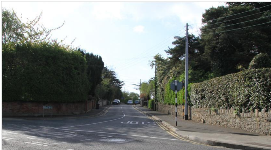
Plate 1: Sydenham Road seen from Taney Road

Sydenham Road ACA derives a considerable amount of character from the contours.