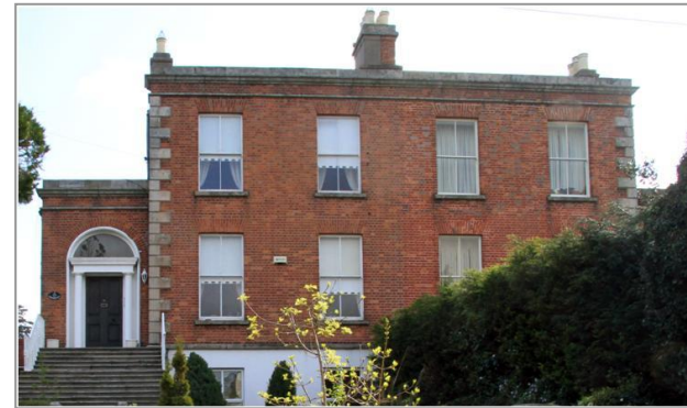
Plate 3: No's 3 and 4 Sydenham Terrace

Opposite Sydenham Terrace a pair of smaller semi-detached houses was built in a style that derived more from the Georgian period, without the side extensions and with the doors in the front facade, approached by a flight of granite steps. To the south of these another pair of semi-detached houses of the same period opted for the rendered form that was common in contemporary suburbs in Blackrock and Dun Laoghaire. These have front doors set in glazed screens and with projecting canopies above as a form of open porch.