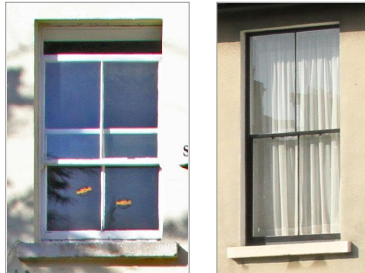
Plate 5: Windows No.7 and Tudor House

Windows: The majority of houses in Sydenham Road have timber sliding sashes. The windows to the front of the earliest houses from the 1860s would probably have been two-over-two sashes, though six-over-six sashes survive to the rear of some of these houses and were probably just used at the rear. The windows on Tudor House demonstrate the simple elegance that two-over-two sashes can give to a house. The contrasting elegance and character arising from the well-kept timber sashes in numbers 7 and 8 contrasts with the unfortunate replacement of sashes with uPVC in numbers 9 and 10.