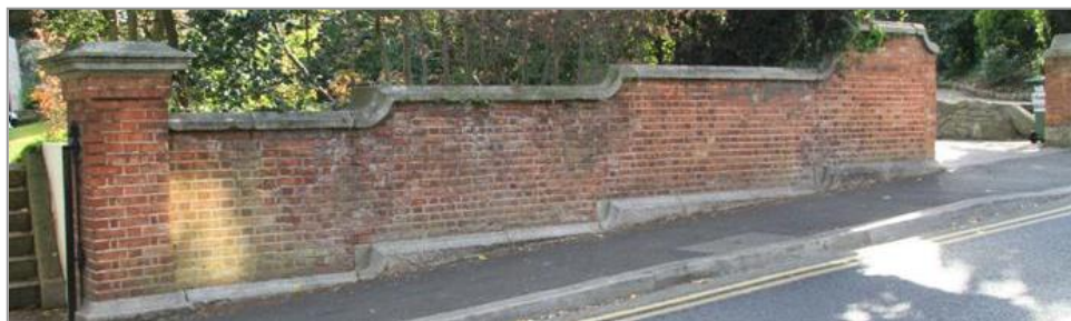
Plate 9: Boundary wall of No's 1 and 2

Vehicular entrances and garages: All of the houses have vehicular access of some kind. The provision of parking is exacerbated by the substantial rise in levels on the eastern side of the street and by the presence of double yellow lines along both sides of the entire street and the adjacent Taney Road and Upper Kilmacud Road. In some instances the entrances have been kept narrow and low-key, often using the original gate piers, as at Tudor House.