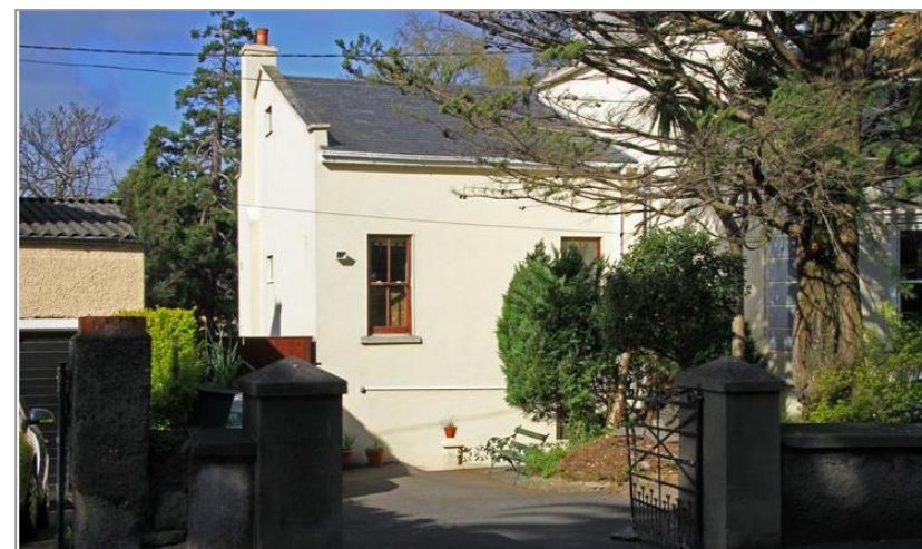
Plate 10: Extension to the side of number 7

Alterations and additions: Most of the houses have not undergone significant alterations or additions over time other than replacement of windows or formation of vehicular accesses. Some have had additions such as conservatories built to the rear, and which do not affect the appearance as seen from the street. Some have had extensions to the side that are discreet and have little effect on the character, such as a single-storey red-brick extension to the side of number 3 and a large extension to No.7 that is in similar materials and style. The most significant additions have been the erection of a house attached to the side of number 8.