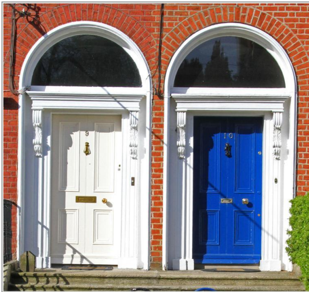
Plate 6: Front doors of numbers 9 and 10