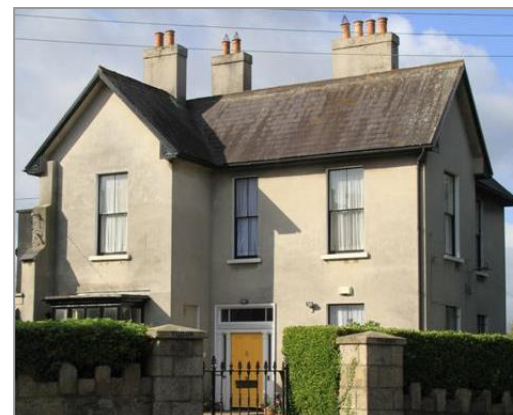
Plate 4: Tudor House