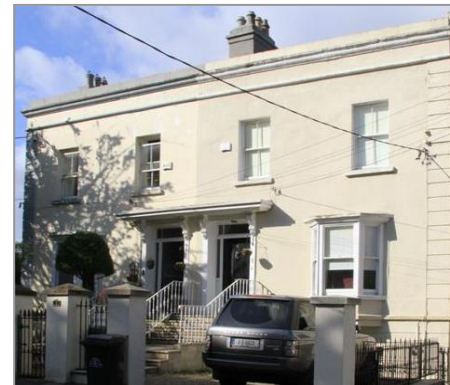
Plate 3: No's 7 and 8