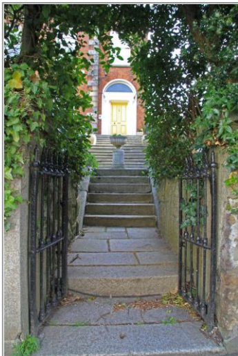
Plate 7: Approach to front door of No. 4

Front boundaries: All of the houses in Sydenham Road have masonry front boundaries though there is a great deal of variety. The finest of all of them is the wall to the front of numbers 1 and 2, which is of red brick, rising off a cut granite plinth and with cut granite capping, with both plinth and capping having delicate profiling and both stepping up through curved mouldings to accommodate the rise in ground level across the frontage. There are piers to match. The other four houses in Sydenham Terrace have rendered walls, some with simple granite copings, others without.