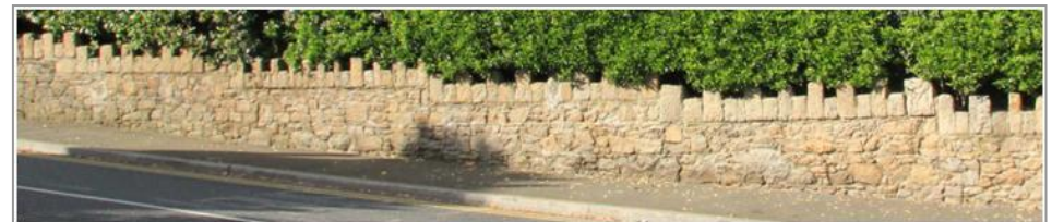
Plate 8: Boundary wall of Tudor House

Along the rest of the street the boundaries include low cut granite plinths with iron railings at numbers 9 and 10, while railings are present with rubble granite or rendered walls at numbers 7 and 8. Tudor House has a long and prominent wall that has a crenellation of squared granite blocks, while the wall to the front of Brentwood has been rebuilt recently in concrete, clad with rubble granite.